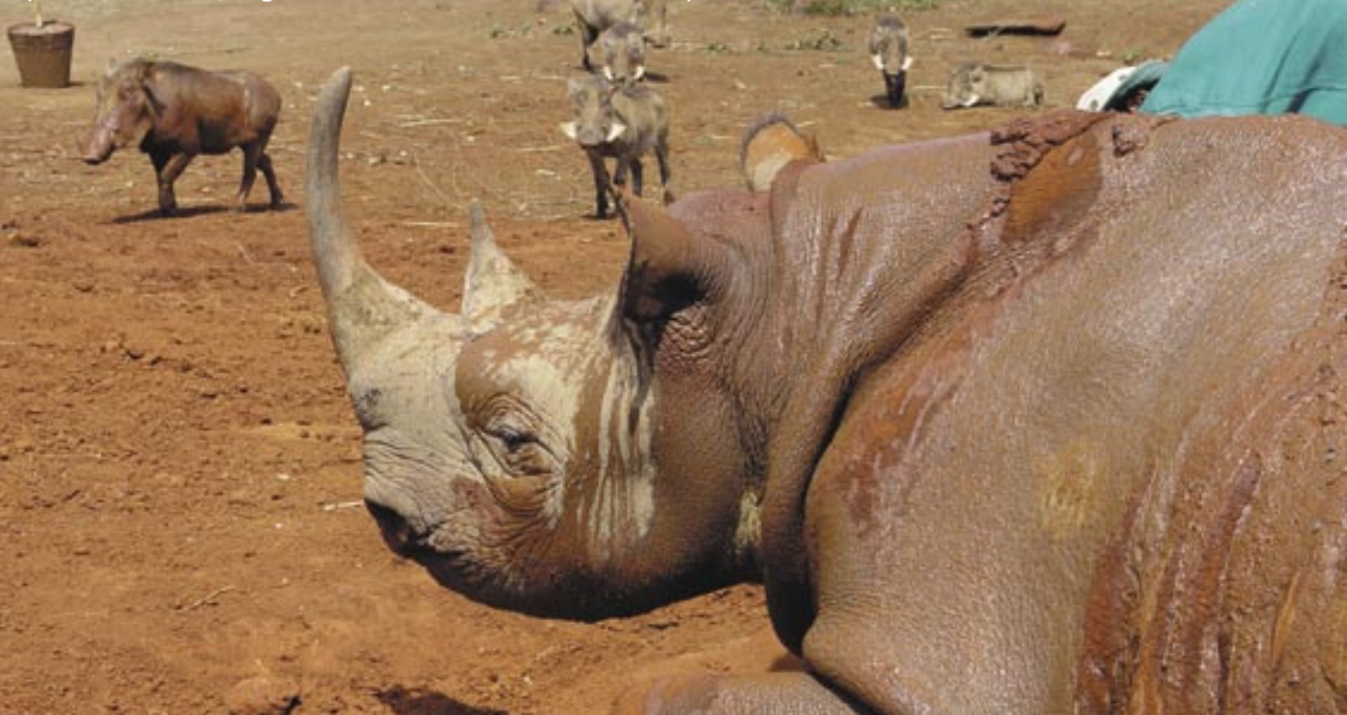
Orphaned at 3 weeks, Magnum the rhino still returns to visit the keepers

I was born into it. Growing up in Kenya in the highlands I had my first orphaned antelope when I was three. My brother was the first warden of the first national park and when I met my husband I married into the National Parks service. I feel extremely fortunate because there is nothing else I want to do. I have always loved animals both