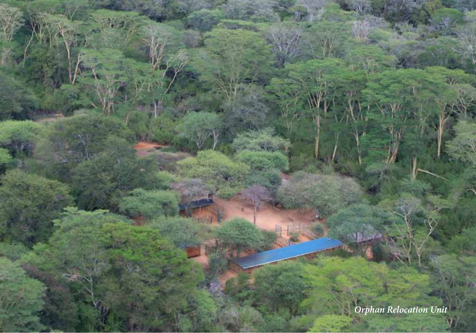
Orphan Relocation Unit