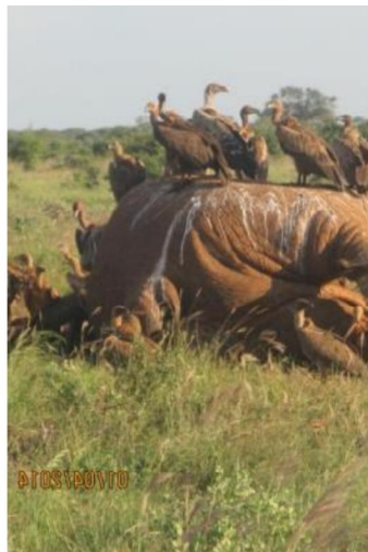
An elephant carcass was found by the Burra team, easily discovered by the hundreds of vultures swarming the body.