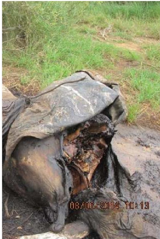
Another elephant carcass was found in the Satao area, again poached with ivory removed.