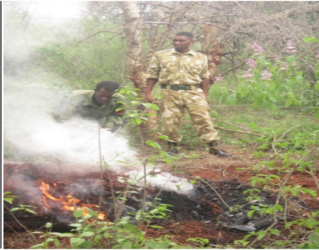
Above: Serious charcoal burning at Mtito River.