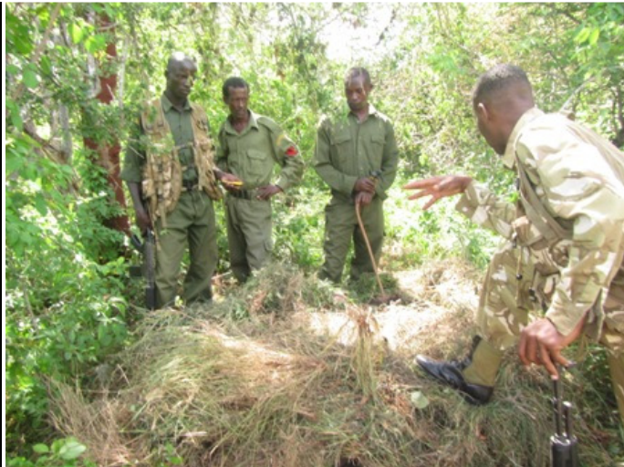
Charcoal kiln found at Mtito river.