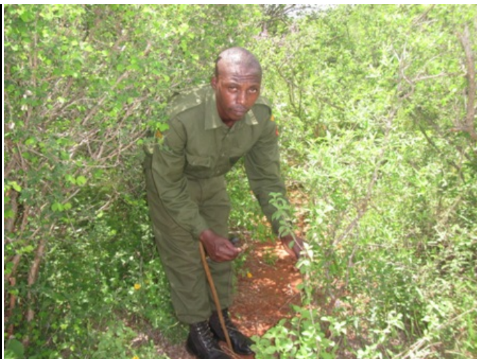
Above: Chui team leader lifting a snare at Triangle area.