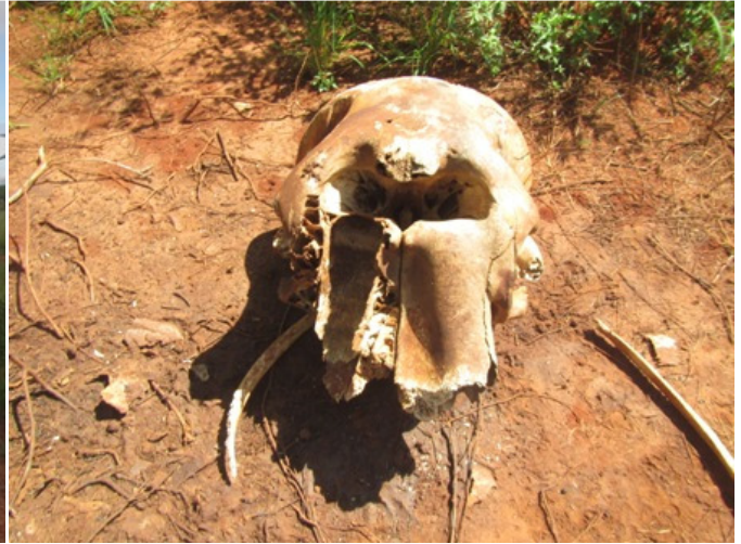
An old elephant skull found in Triangle area