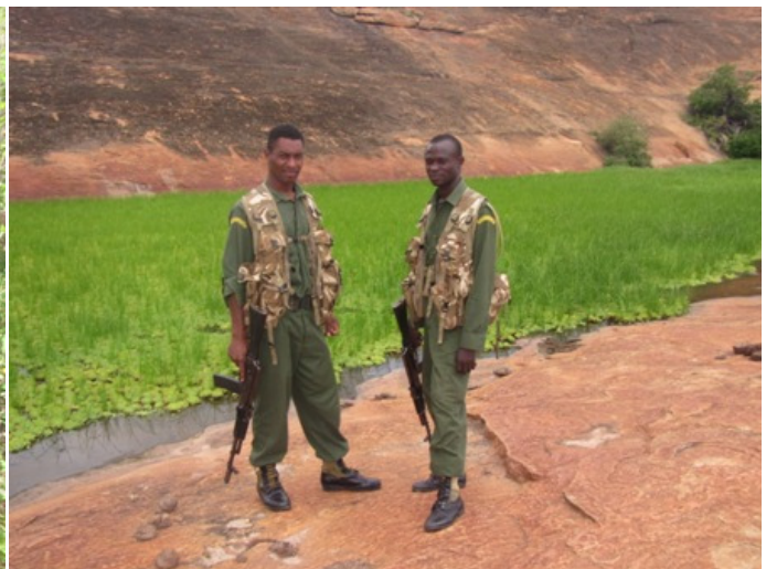
Above: Desnaring exercise at Kenani area.