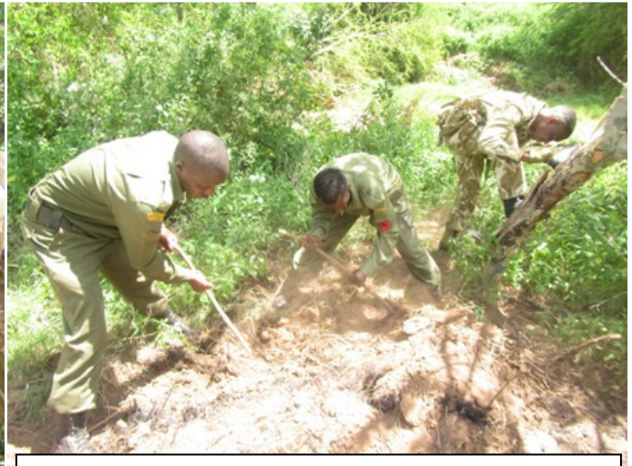
Chui team destroying a charcoal kiln at ZeroDelta.