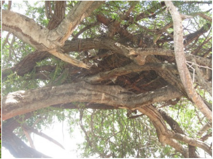
Above: Shooting platform found at triangle area.