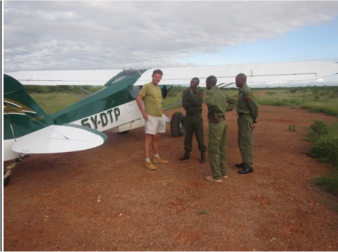
DSWT pilot with Chui team at Kanga airstrip.