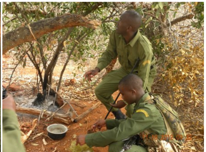
Above: a bush meat poacher's hid near Imenti Dam