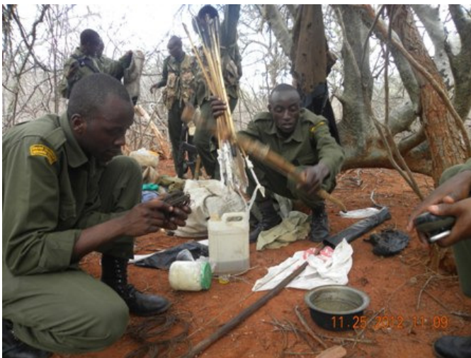
Above: poachers' hideout in Kalovoto area