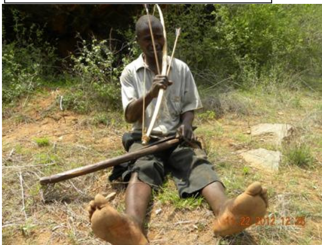
Above: arrest of a poacher with poison arrows which target elephant