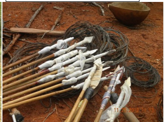
Above: snares and poison arrows recovered from a poacher's hideout