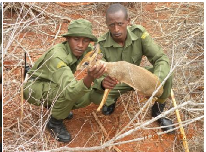
Above: the team managed to rescue a dikdik from a snare