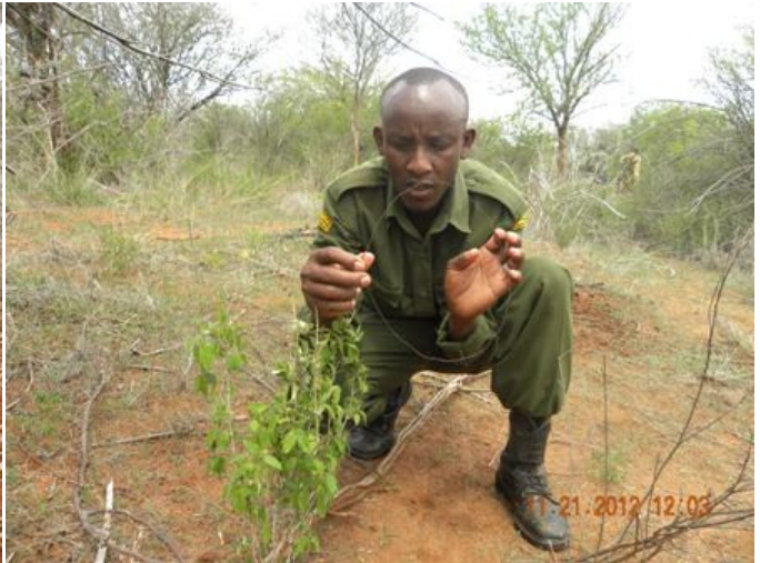
Above: the team removing thin wire snares which target dikdik