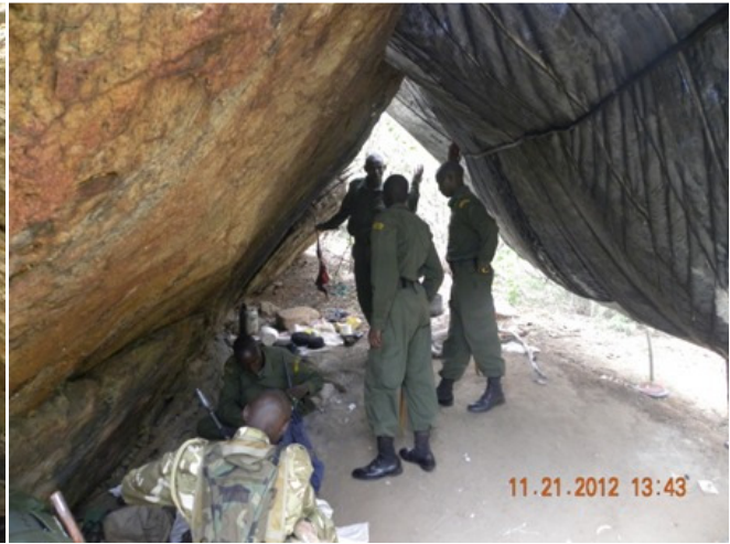
Above: the team discover a well established poachers' hide near Gazi area. The camp was destroyed and all items confiscated