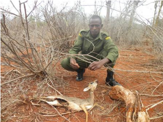
Above: a snared dikdik carcass near the Imenti Dam