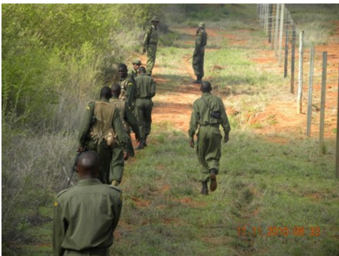
Above: the team patrol along the Kasaala fence line