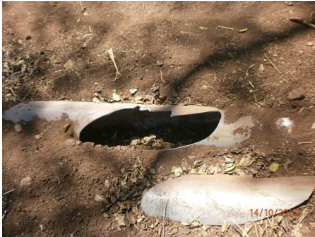
Broken new pipeline kibwezi.