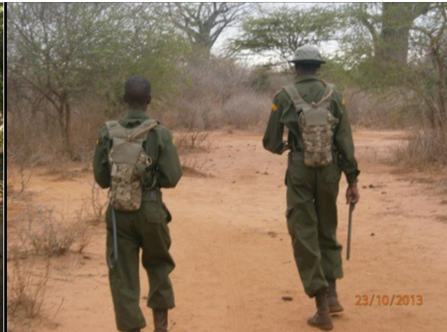
Patrolling in Kenze area.