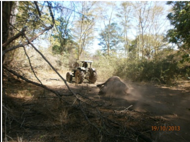
Removing an elephant carcass from Umani area.