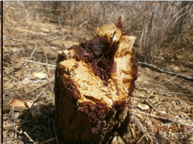
Logging at Duwa area.