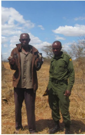
The Mtito team arrested an elephant poacher from Kitui area who was caught with poisoned arrows