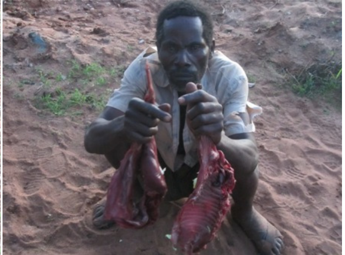
Above: a poacher arrested in possession of game meat