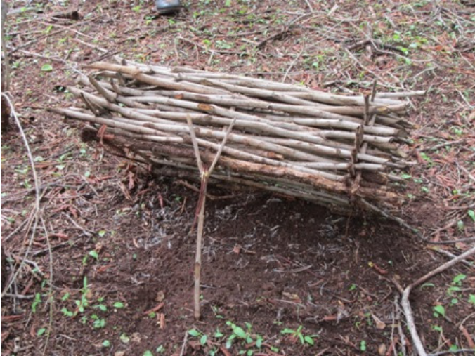
Above: a game bird trap found in the Tsavo West NP triangle