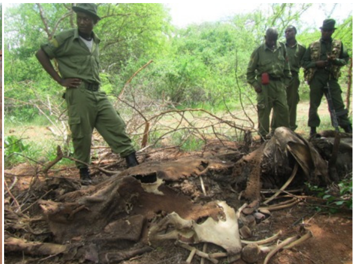
Above: an elephant carcass found on Tsavo Farm (outside the National Park)