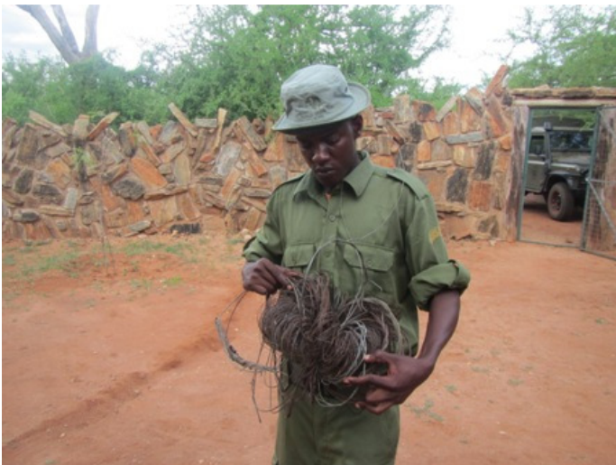
Above: a team member carrying the snares collected during a patrol