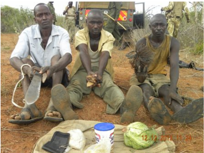
Above: poachers arrested at Gazi area