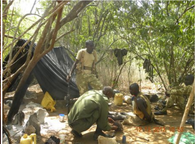
Above: a poacher arrested in his hideout