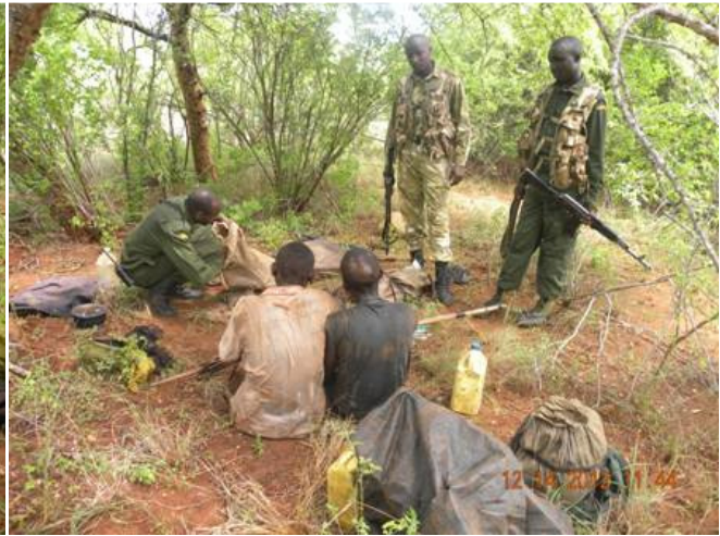
Above: the team arrest 2 poachers in possession of poison arrows. These weapons are most commonly used to kill elephants in the Tsavo Ecosystem