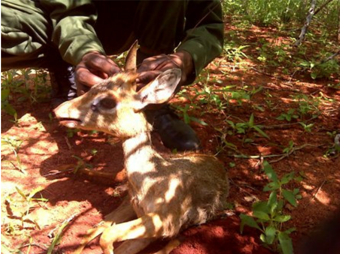
Above: a fresh snared dikdik carcass found at Umbi area