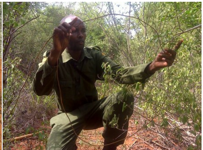
Above: removing medium sized snares which target game such as impala and kudu