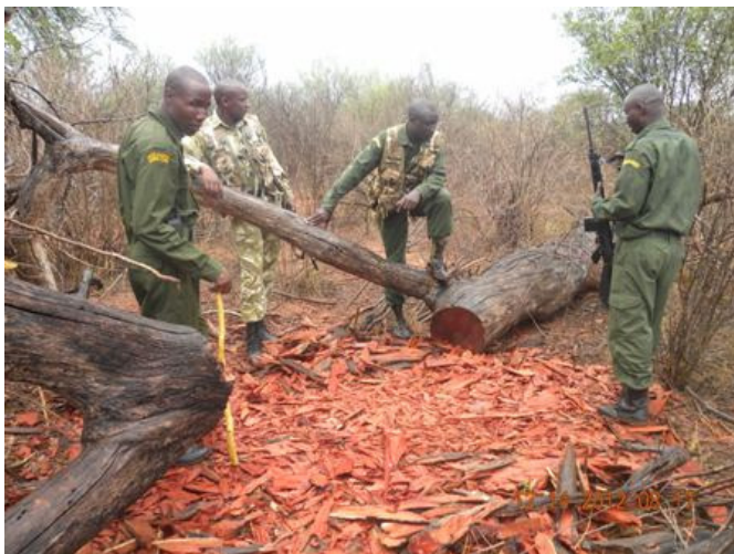
Above: illegal logging at Tundani area inside the Park