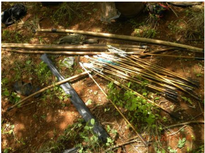
Above: poison arrows, bows and other items recovered from the arrests