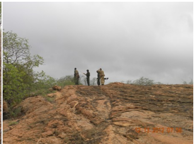
Above: the team on patrol in Kalovoto area