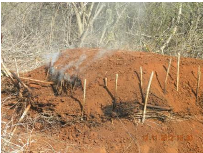
Above: illegal charcoal kilns in Gazi area