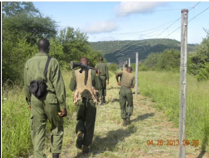
Above: Ndovu team patrolling along Kasala area.