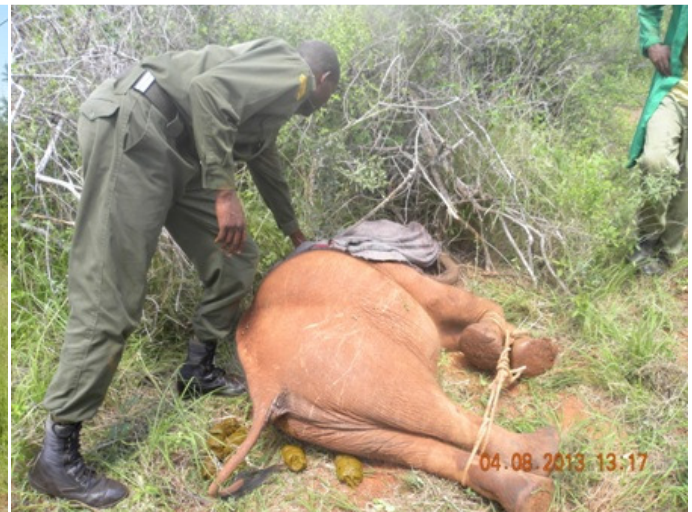
Above: rescuing a baby elephant at Tundani area.