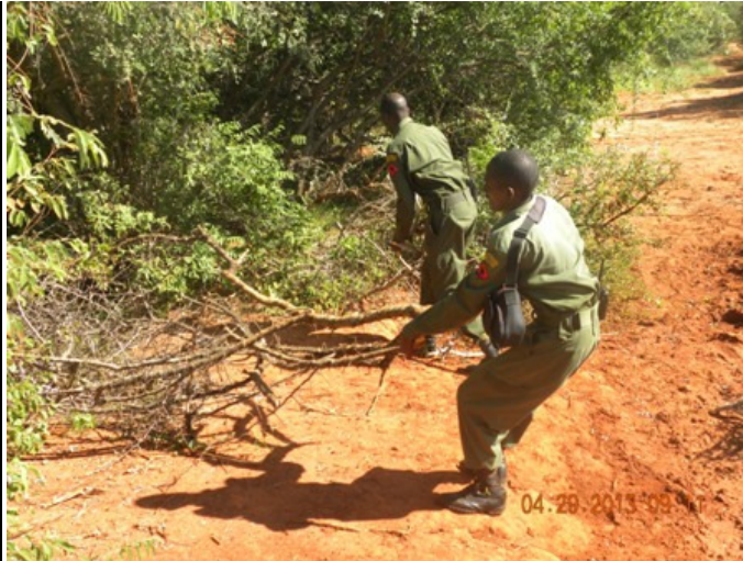
Above: Destroying a shooting blind in Tundani.