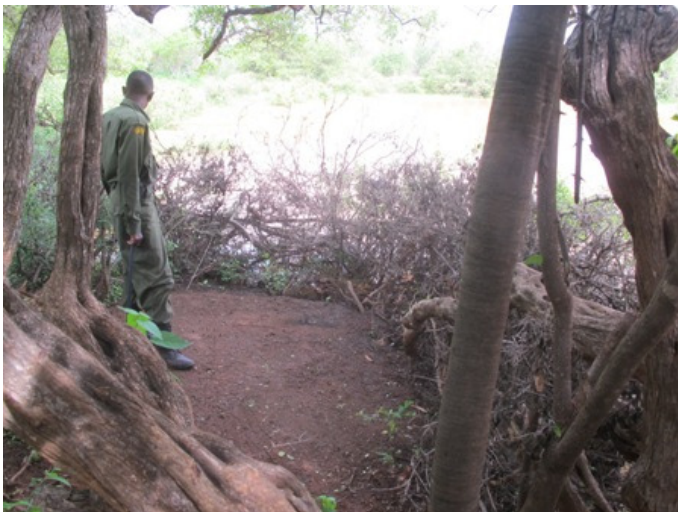
Above: a poachers blind found in Tundani area