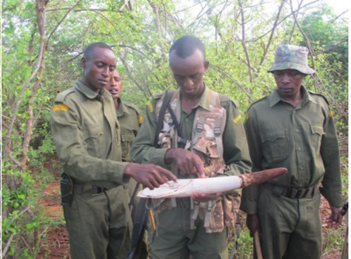
Above: the team finds a broken piece of ivory