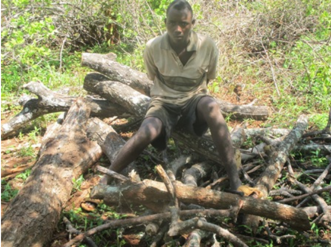
Above: a man arrested for illegal charcoal burning near Gazi