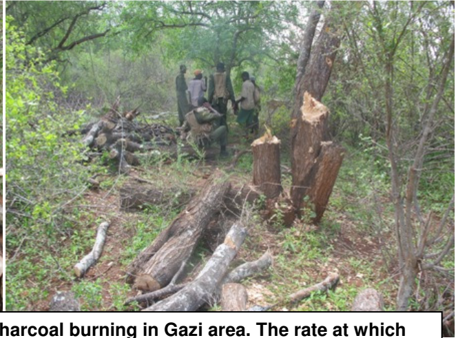
Above: logging of indigenous hard woods for charcoal burning in Gazi area. The rate at which these activities are taking place are too high for the trees to re-grow, and hence is a potential long term threat to the ecosystem in Tsavo