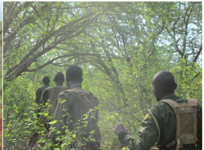
Above: the team on patrol in Kasaala area