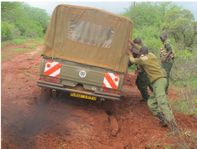
Above: the team working hard to get their vehicle out of the mud