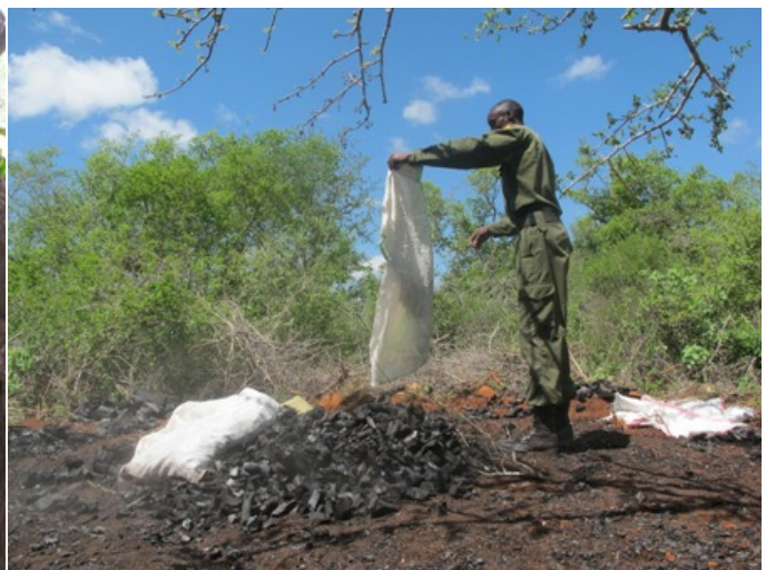
Above: many sightings of charcoal burning found in Gazi area which is a big threat to the indigenous forest cover in the Park