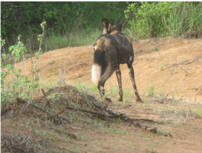
Above: three wild dogs seen at Tundani