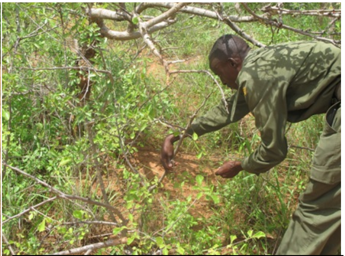
Above: removing small sized snares which target game such dikdik