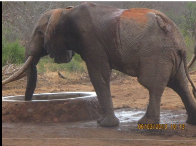
Above: A wounded elephant drinking water.