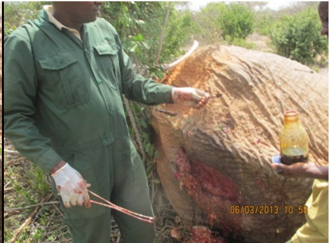
Above right: The vets removing the poisonous arrow from the elephant.