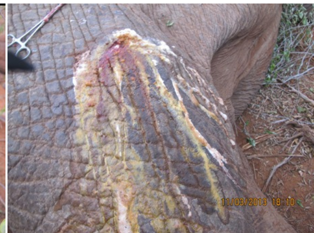
Above: Vets treating a second elephant.