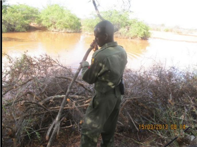
Above: Destroying a shooting blind in Tundani.