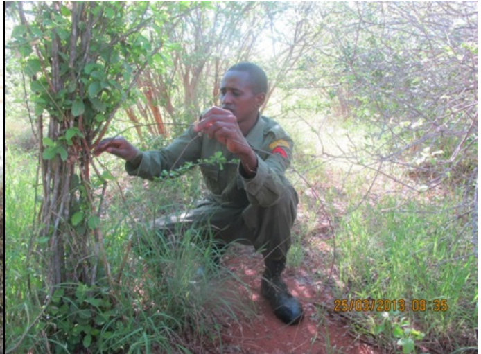
Above: Lifting a medium snare at Power line.