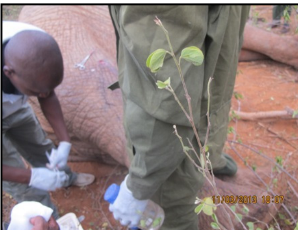
Above: Vets treating a second elephant.