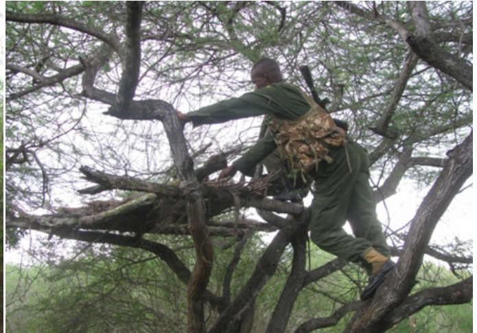
Above: KWS rangers help destroy a shooting platform .