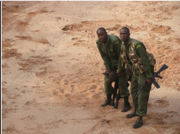
Above: The team rescuing a blind orphaned buffalo at Mzima springs.