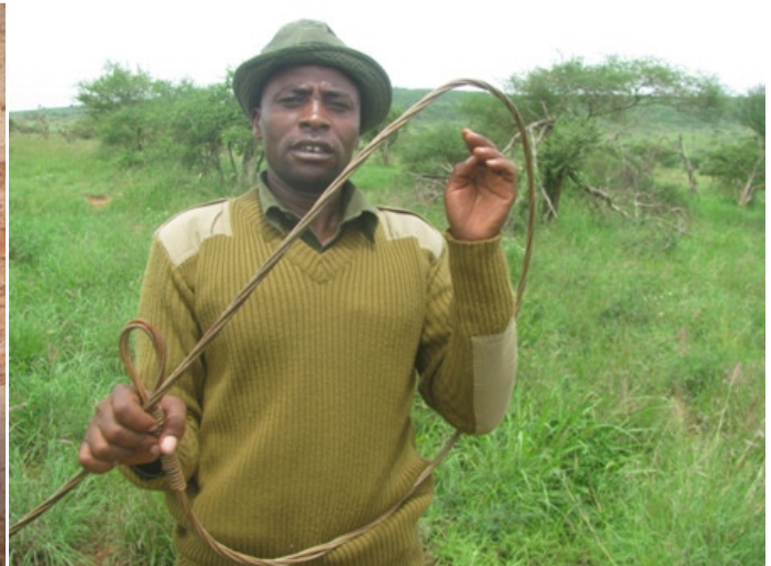
Above: Buffalo cable snare found at Salt Lick ranch.