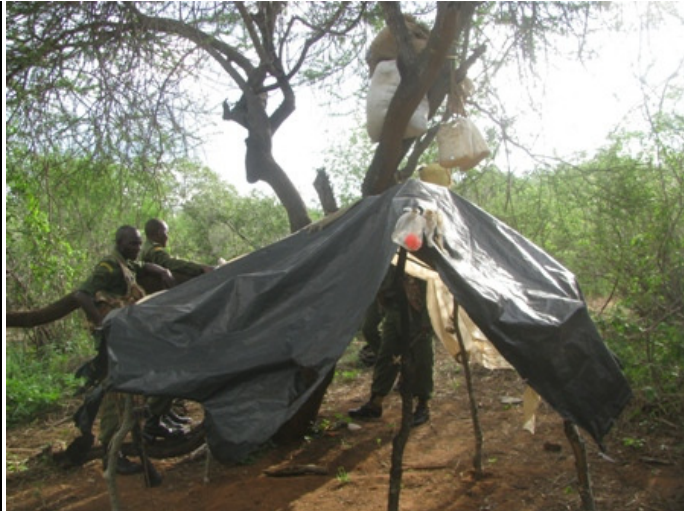
Above: Destroying a shooting blind at Leslau area.