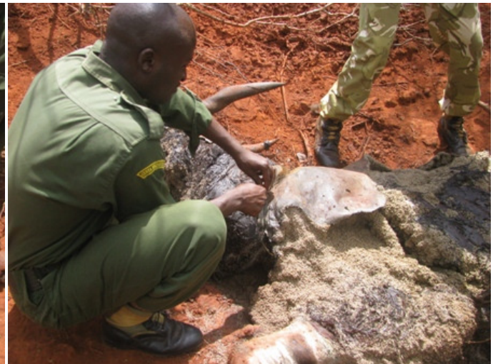
Above: a team member removes the snares from the carcass