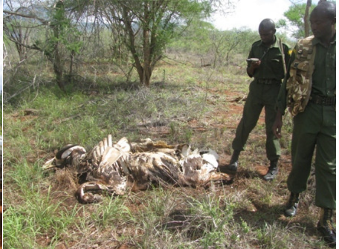
Above: a buffalo carcass found at Salk Lick