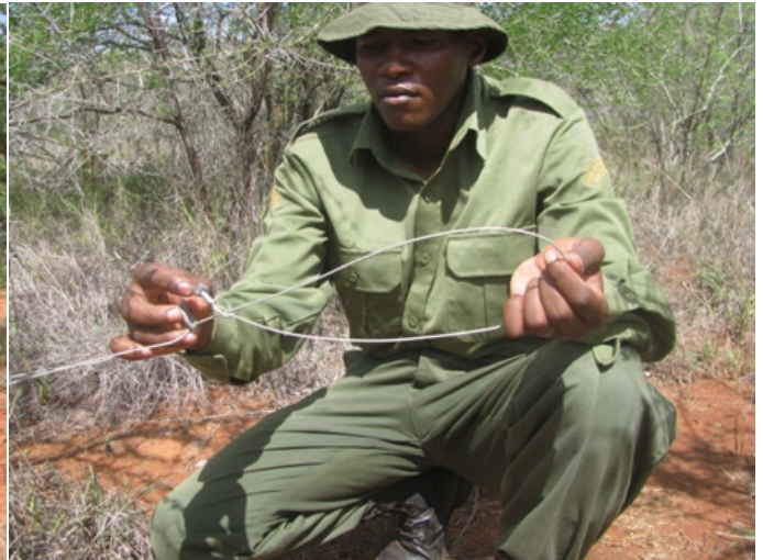
Above: the team removing snares on Salt Lick Ranch