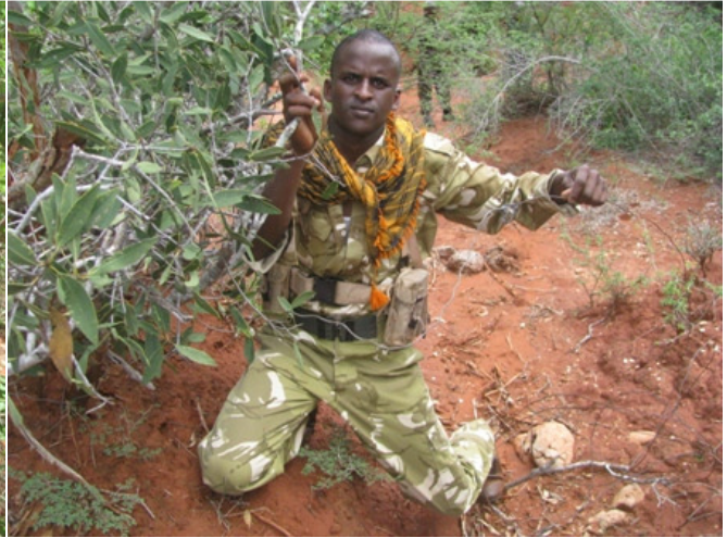
Above: The team removed many snares from the Kenya-Tanzania border near Lake Jipe.