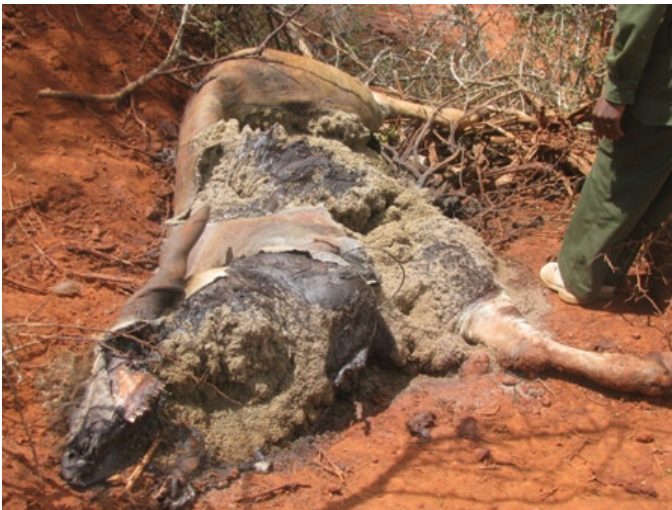
Above: the carcass of a snared Eland found near the Kenya-Tanzania border