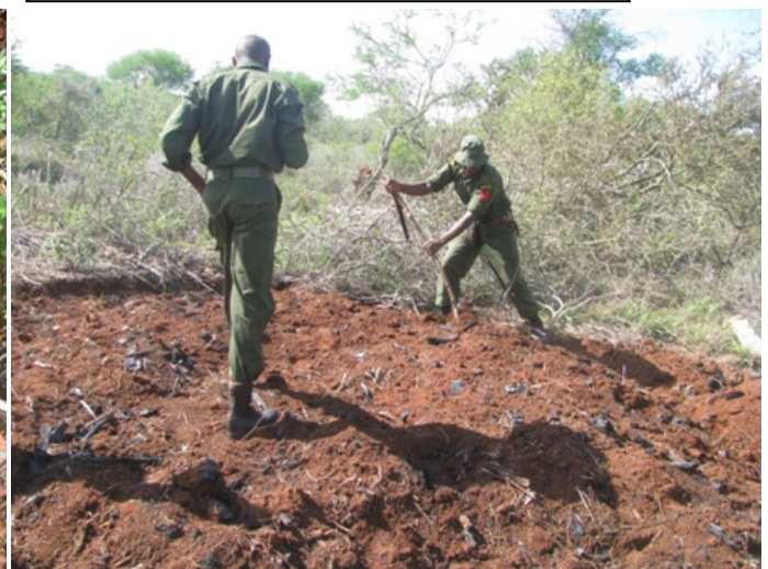
Above: the team destroying an illegal charcoal kiln