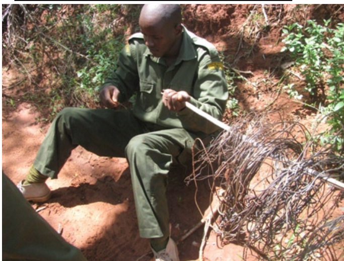
Above: snares removed near Kangeshwa