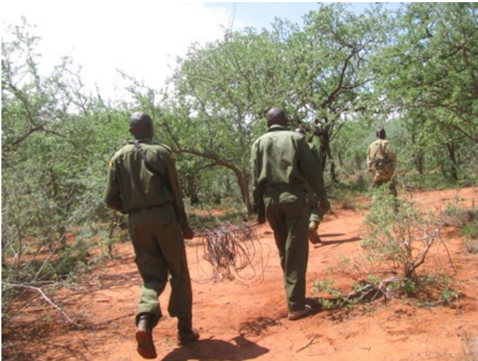
Above: The team patrolling the Taita Group Ranches and removing snares