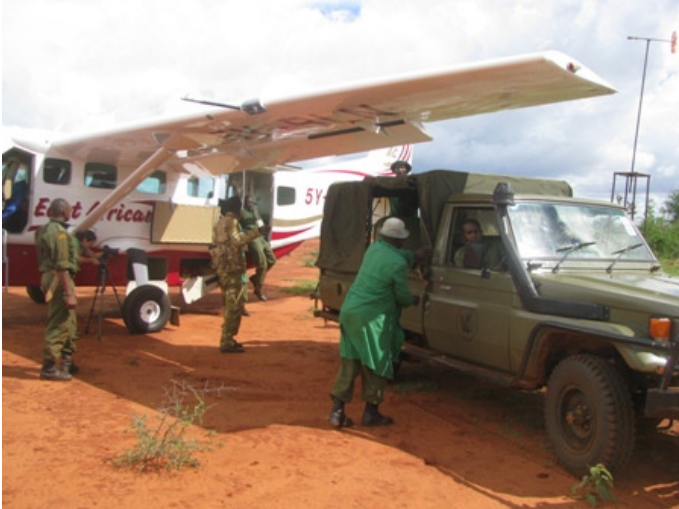
Above: the rescue of an orphaned elephant in the Maktau area, the orphan was loaded in the rescue plane and sent to DSWT Nairobi