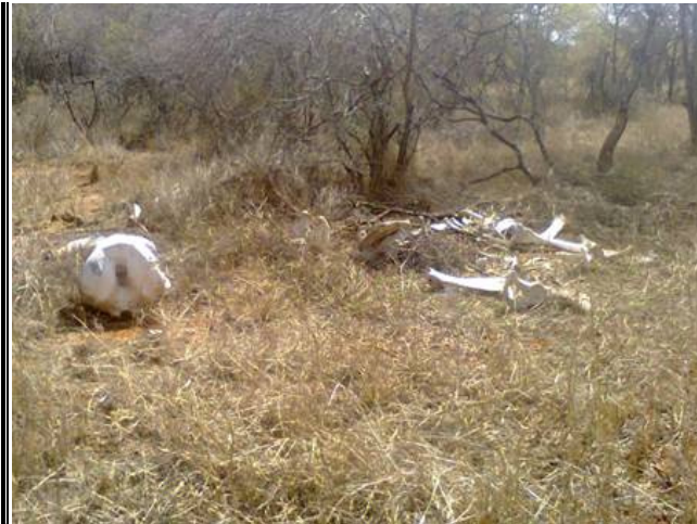
Old elephant remains at Murka area