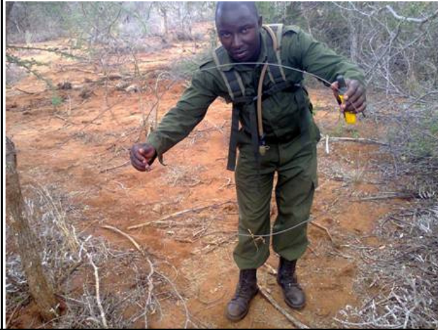
Lifting medium snares game at Salt lick area.