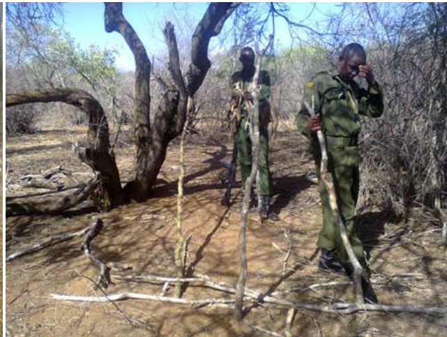
Destroying a recently vacated poacher's hideout.