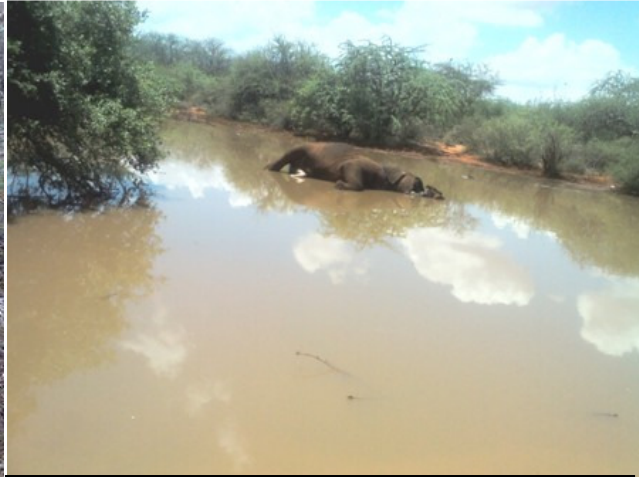
Poached elephant at a dam in Mbulia