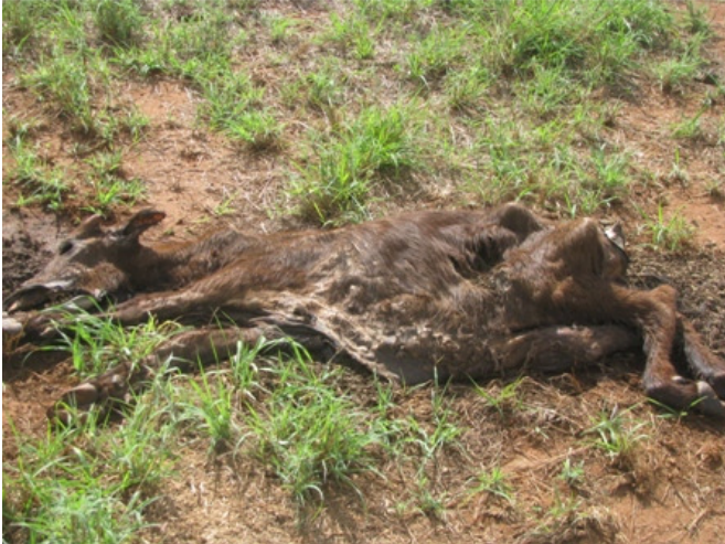
Above: The carcass of a buffalo found in Salt Lick Ranch