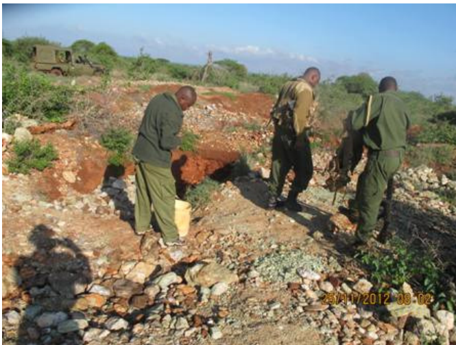
Above: Illegal mining for gem stones inside Tsavo West National Park