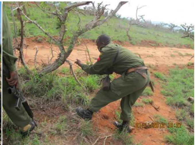
Above: The team removing snares, a total of 49 snares were lifted this month