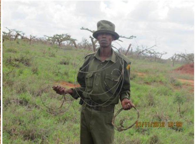
Above: A Team member showing large snares targeting buffalo