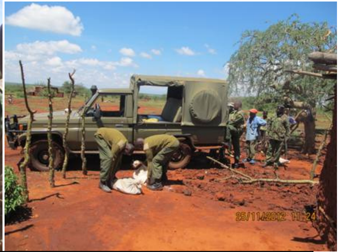
Above: The team followed the footprints of a man mining inside the National Park right to his home and arrested him in possession of gems as well as bush meat which he had killed