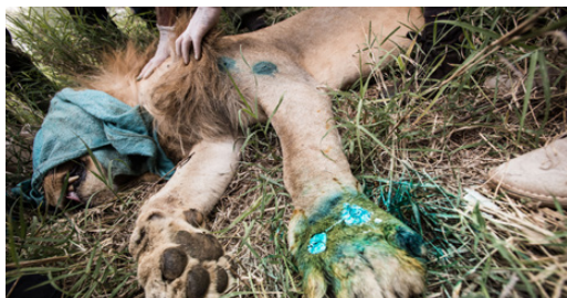
This young male needed treatment from the SWT/ KWS Mt Kenya Mobile Veterinary Unit after he became embroiled in an altercation with another lion and suffered a debilitating wound to his foot.

pain-killers, antibiotics and anti-inflammatories can be administered. In spear, arrow and snare wounds, the Vet will also pack the injury with green clay, a natural, mineral substance which can prevent infection and aid healing. With one last check-up, the patient can be revived and, should the patient need it, the team will use ropes and their custom vehicle to help them back to their feet.