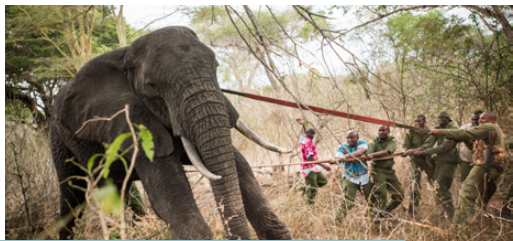
Sky Vets flew a KWS Vet to the scene of a bull elephant who appeared to seek help at the SWT Umani Springs Eco Lodge. Straps were needed to guide the elephant to the floor during the treatment.

Rescue ropes and straps are often overlooked pieces of equipment but can be vital to securing long-limbed animals like giraffes. Tied to the vehicle, they can also be used to roll elephants over should they fall asleep on their injured side – a very frequent occurrence! While the Vet assesses the patient, staff cover the patient's eye to reduce stimuli and prevent sun damage. For elephants, they also prop open the trunk so the airway remains unobstructed. More often than not, injuries are caused by human activities, including spears, snares and arrows, and wounds are infected or septic. Equipped with jerry cans of water, the Team can flush and thoroughly clean a wound, very often removing an embedded arrow, spear head or maggots. Then, with the injury completely disinfected, drugs including