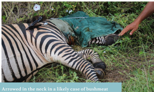
Arrowed in the neck in a likely case of bushmeat poaching, this zebra was treated by Sky Vets and has gone on to make a full recovery.