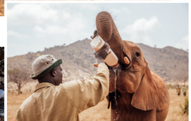
Free school field trips give students the chance to visit our Voi Reintegration