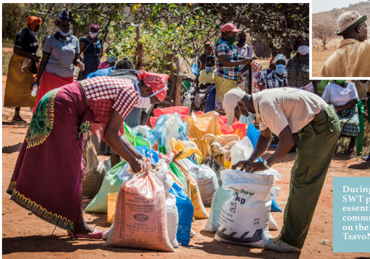
During 2020, the SWT provided essential food to communities living on the border of Tsavo National Parks.