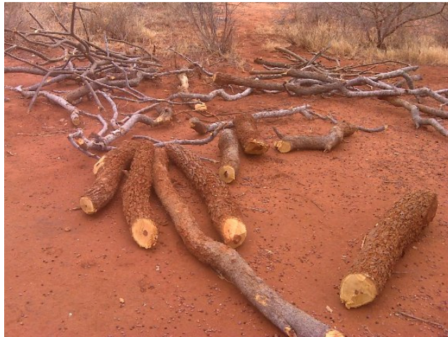
Above: Logging at Sagalla