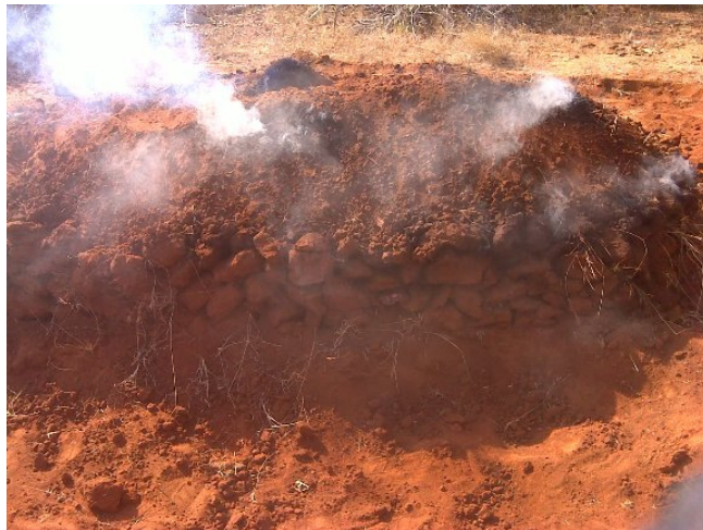
Above: Charcoal burning at Sagalla Ranch