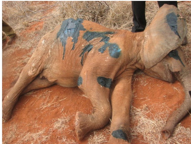
Above: The Rescue of an orphaned elephant at Sagalla