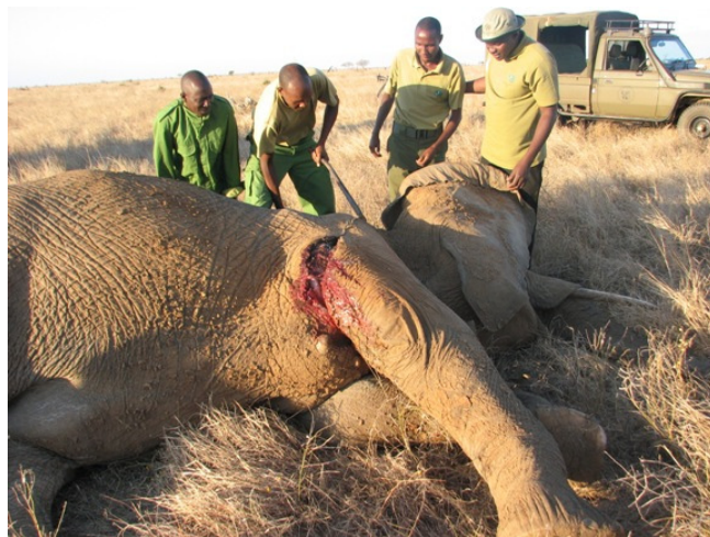
Above: Helping the Vet Unit with a second snared elephant case