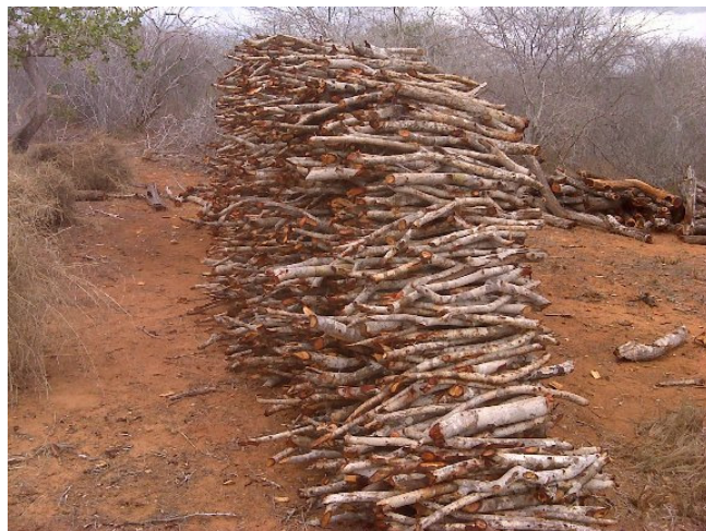
Above: Logging at Kaluku