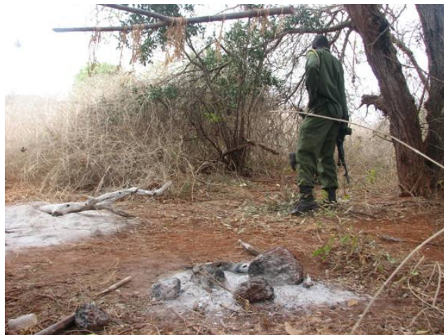
Above: A poachers hideout