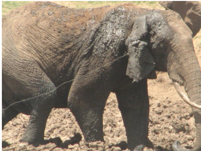
Above: A snared elephant the Team assisted with rescuing