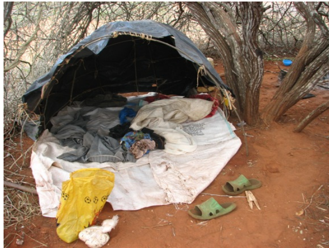
Above: A poachers hideout at Dakota