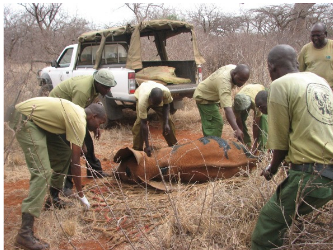
Above: The rescue of the orphaned elephant at Sagalle