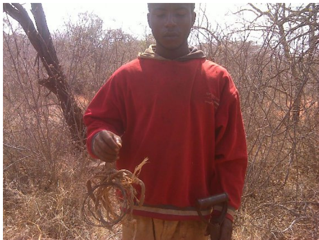
Above: Arrested poacher at Sagalla