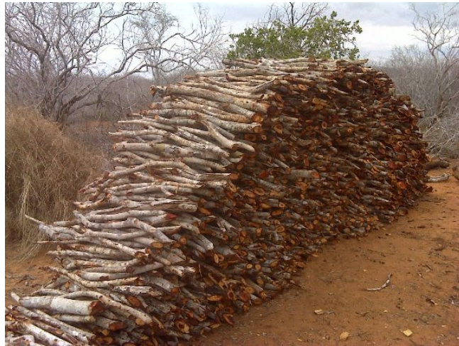
Above: Logging at Kaluku