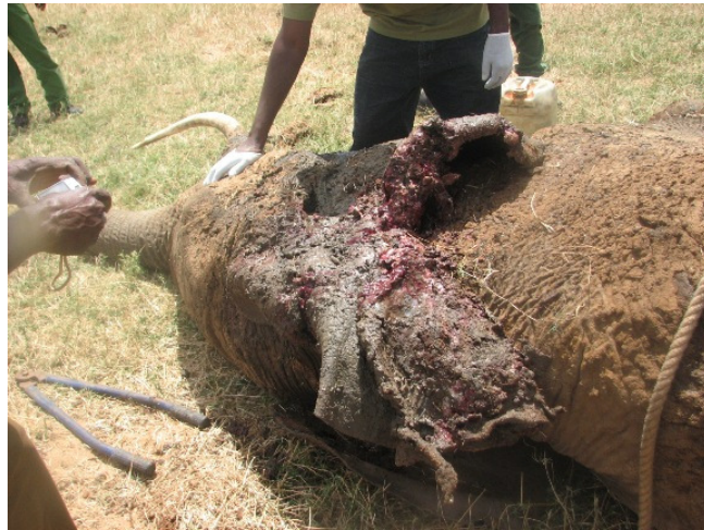
Above: The Team help the Tsavo mobile Vet Unit treat a snared bull.