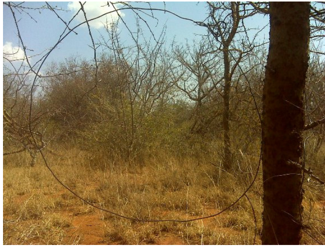
Above: A large snare at Sagalla