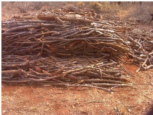
Above: Logging at Sagalla