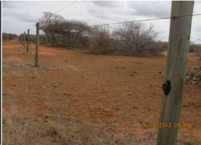
A broken part of the fenceline along Murondo Dakota stretch.