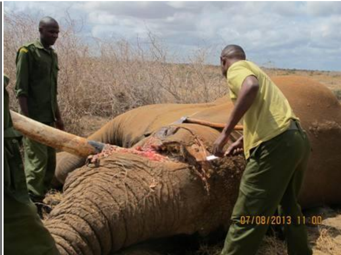
Removing tusks from a poached elephant at Dakota