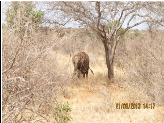
The team with the vet unit attending to a snared elephant at Triangle area.