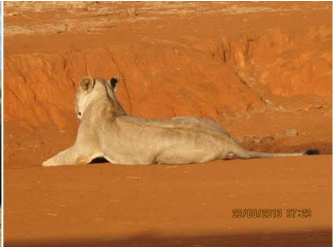
A lioness sighted at Lion hill.