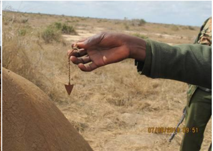
A poisoned arrow from a poached elephant at Dakota