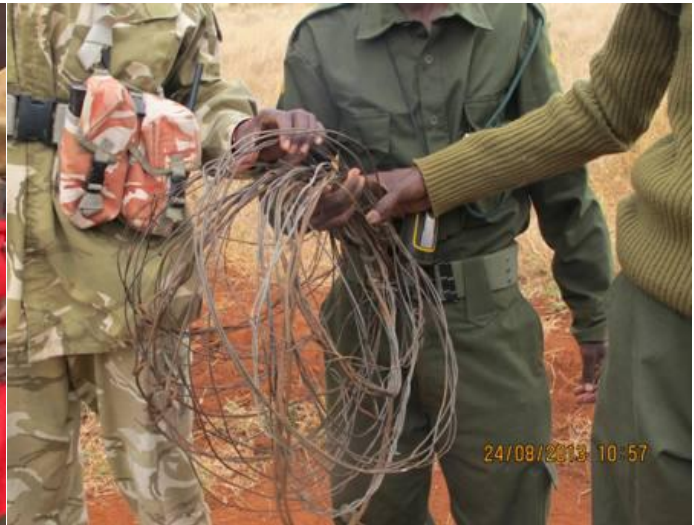
Desnaring around Mbulia ranch.