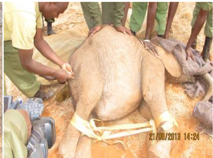
Another baby elephant rescue at Ndi area.