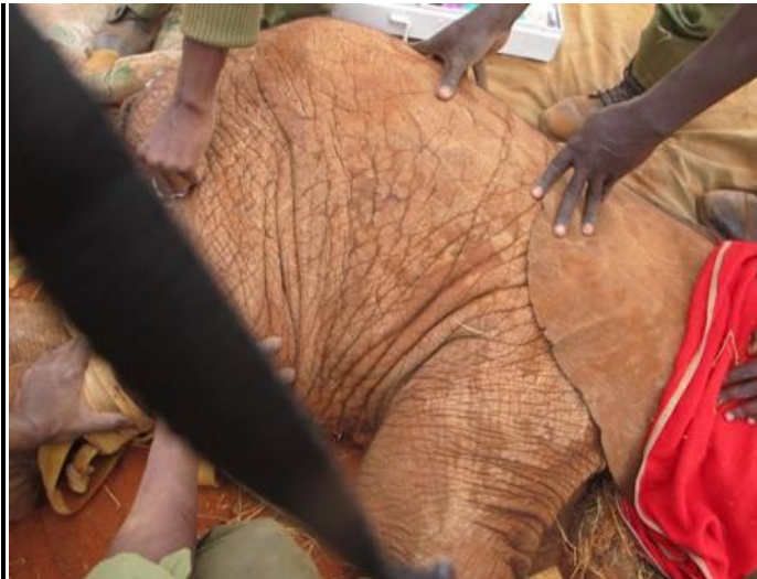
A baby elephant being rescued around Dakota area.