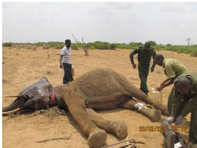
The burra Team work with Tsavo Vet Unit to save the life of a snared elephant