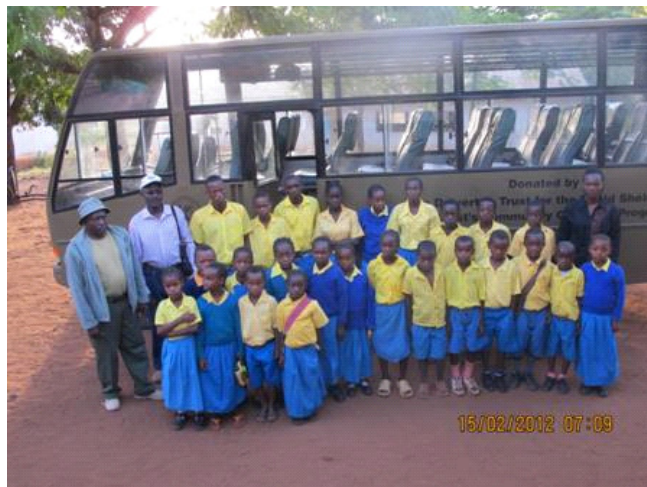
Kajire pupils going on a school trip with the DSWT bus