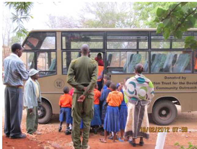
Gimba Students board the bus for thier trip