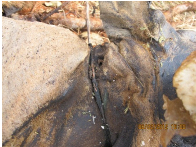
The snare on the elephant's neck which the Team assisted to treat.