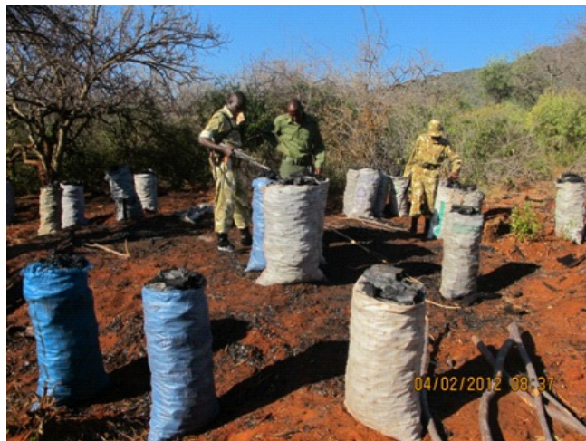
Charcoal recovered at Mbulia