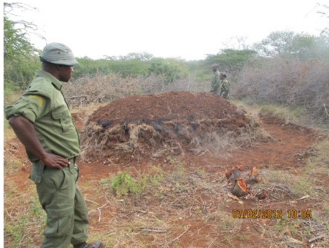
Illegal charcoal burning at Sagalla