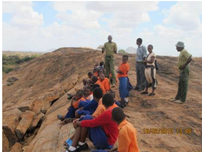
Gimba pupils visit the Mudanda Rock