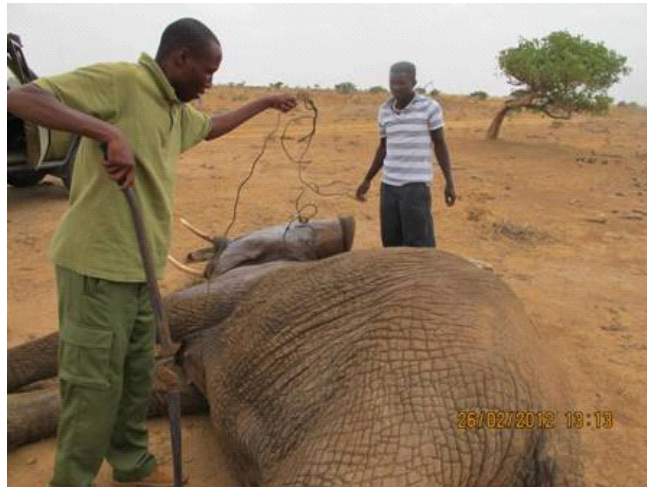
The Team assist the Vet Unit in treating a snared elephant