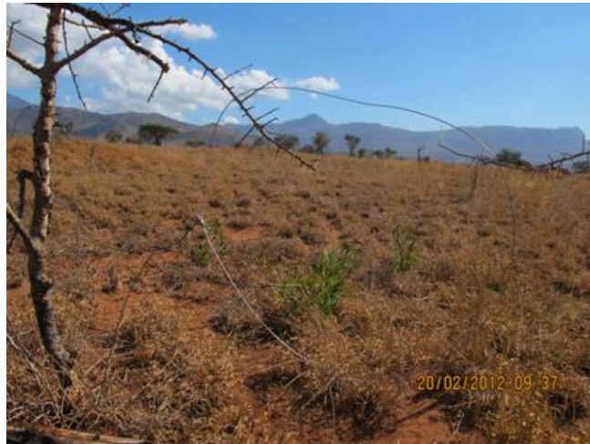
Large snares at Taita Hills Wildlife Sanctuary