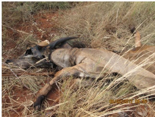
Snared eland carcass at Sagalla