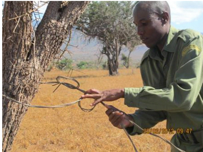
The Team removing snares