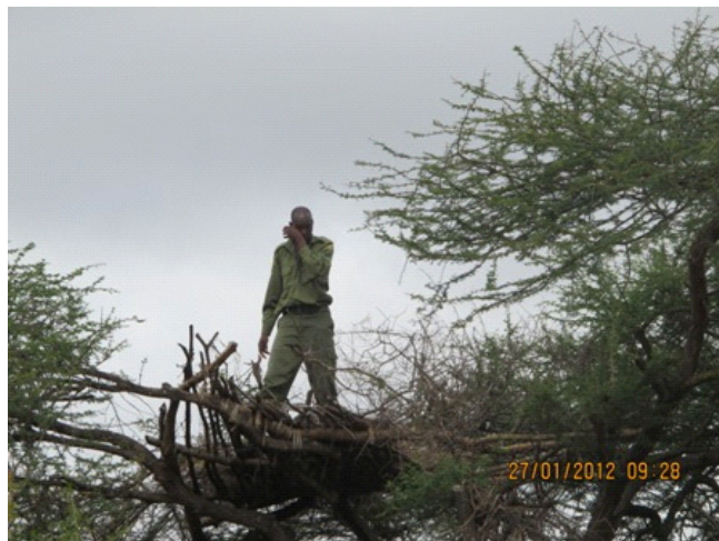
A Team member destroying a shooting platform at Mbulia