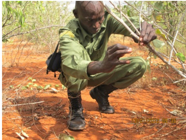
Team member lifting snares at Sagalla