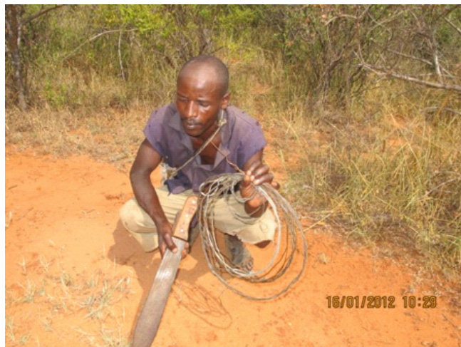
A poacher arrested with snares