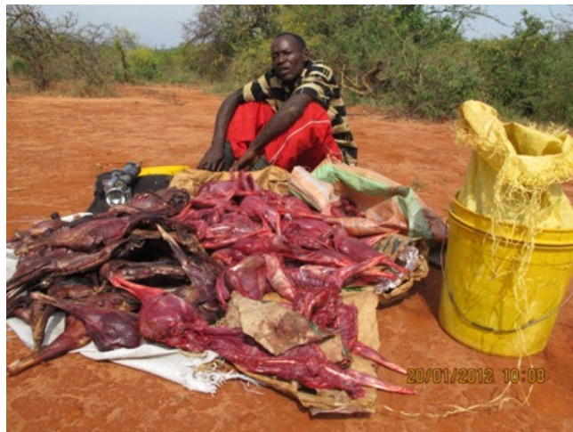
Poacher arrested with bush meat at Ndi