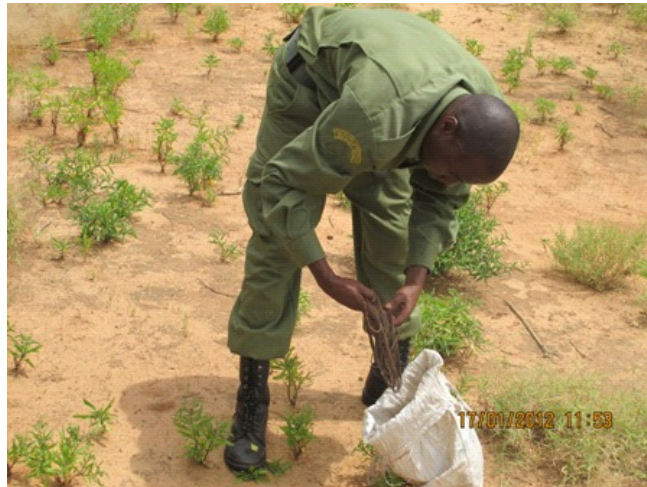
Snares left behind by a fleeing poacher