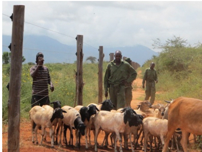
Illegal livestock grazing in the Park