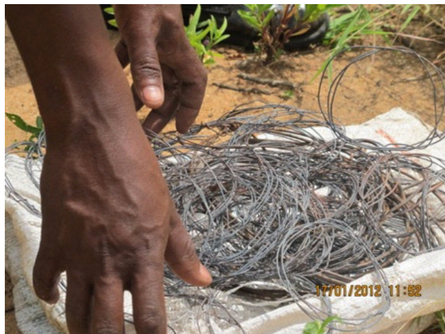
Many snares left behind by a poacher as he escapes from the Team