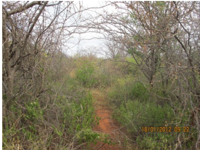
A large snare along an animal path at the Mbulia Park boundary