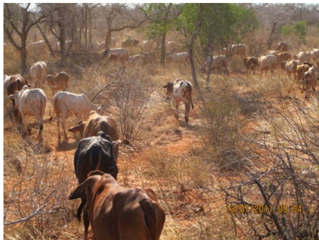
Illegal livestock grazing at Ngutuni Ranch