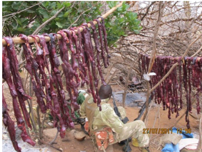
Poachers hideout at Tundani