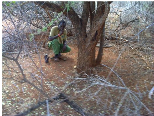
A shooting hideout at Wamata