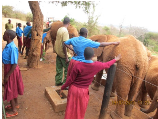
Sowa pupils visit the elephant orphans