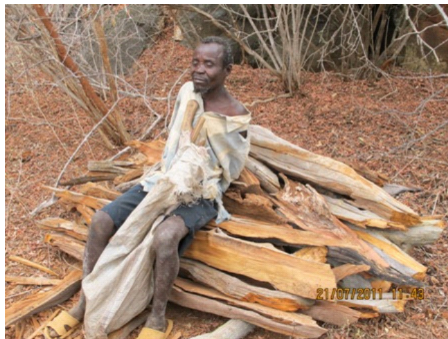
Arrested poacher at Kasaala