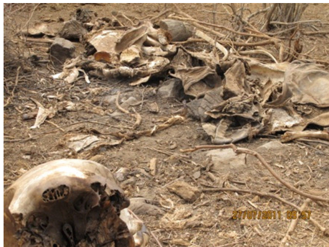
Elephant carcass at Tundani