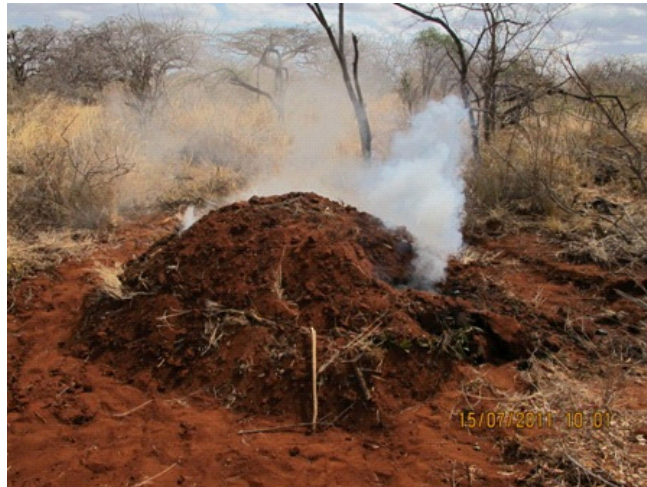
Illegal Charcoal kilns