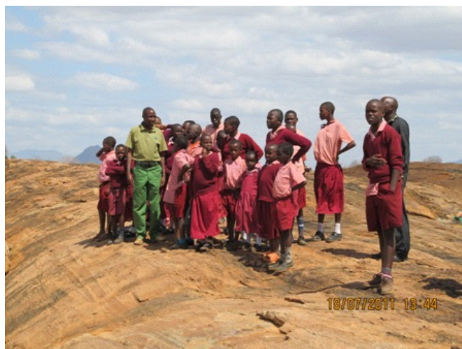
Mwandisha pupils visit Mudanda Rock