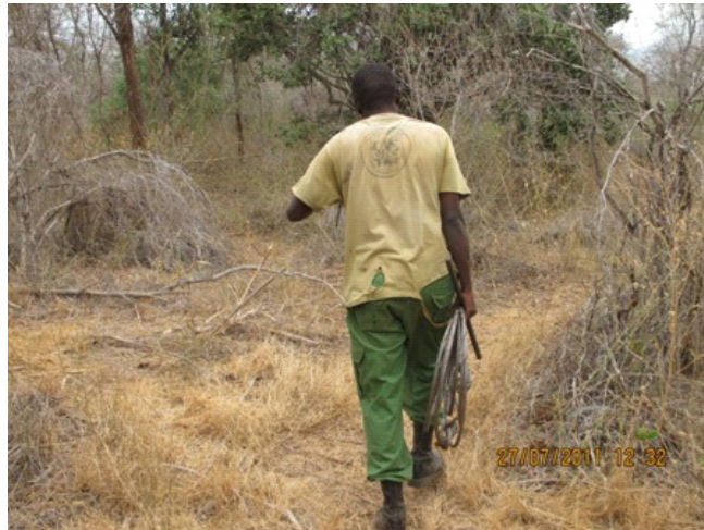
A Team member with large snares