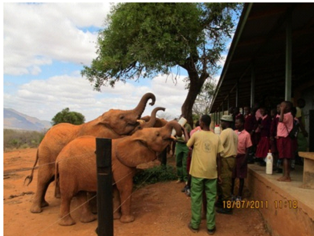
Mwandisha pupils meet the Voi orphans