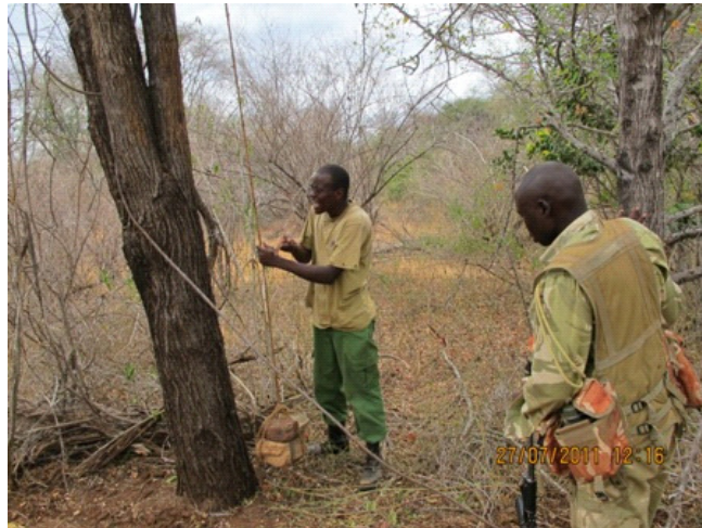
Lifting an elephant snare at Tundani