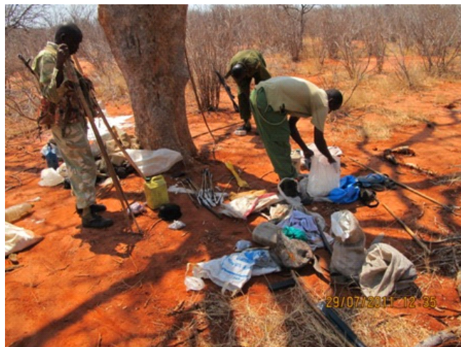
Poachers hideout at Wamata