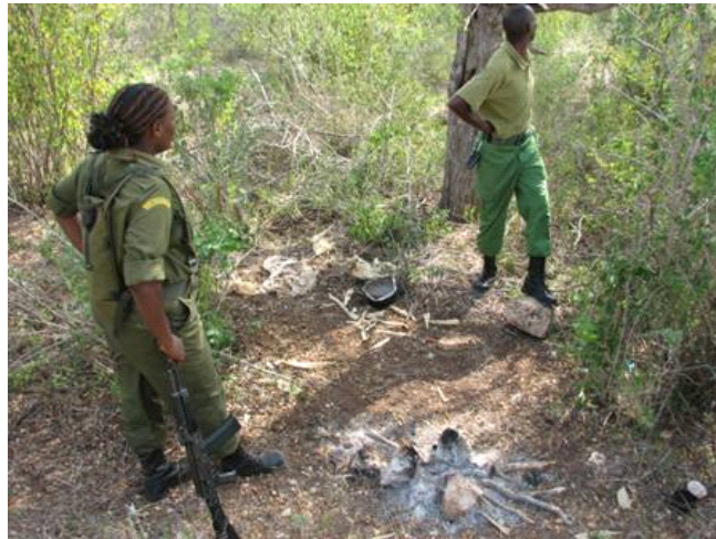
Poachers hideout at Mbulia Ranch