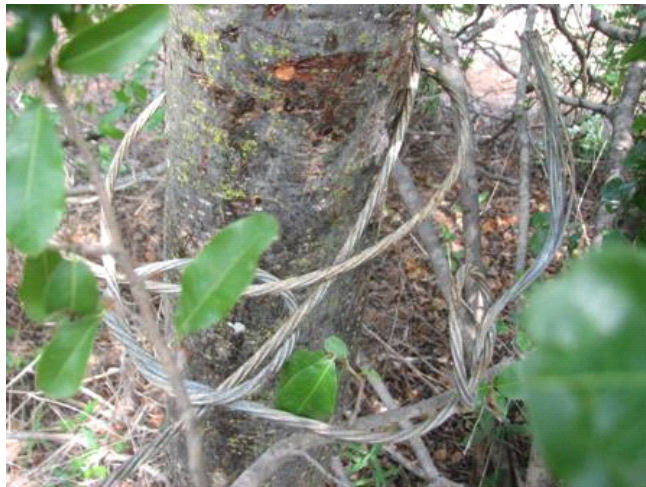
Large snares at Mbulia Ranch