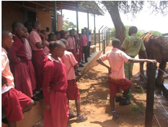
Mwandisha pupils visit the Voi stockades and learn about the elephant orphans