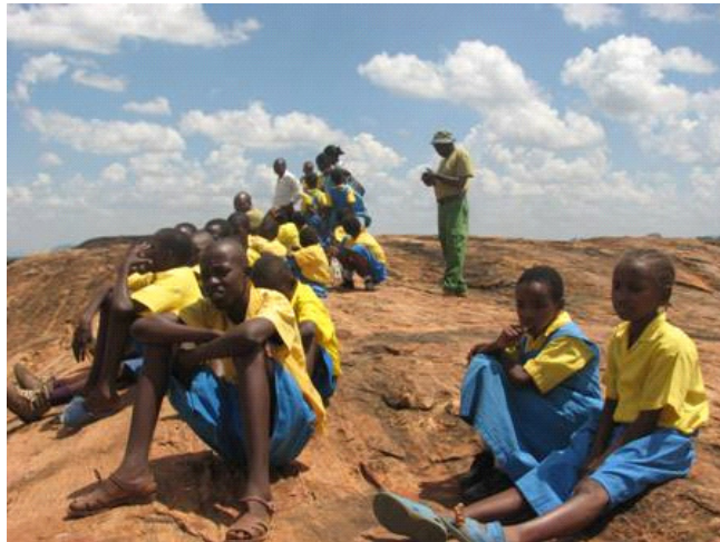
Kajire pupils visit Mudanda rock