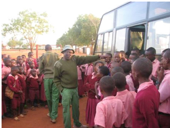
Mwandisha pupils prepare for a school Trip