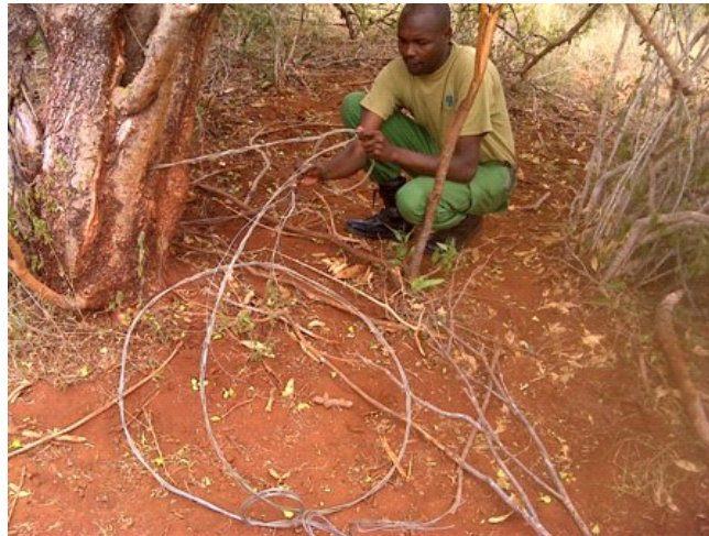
Team lifting big snare at Ngutuni Ranch