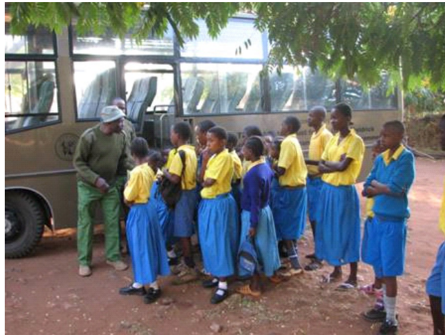
Kajire pupils getting ready for a Trip into the National Park