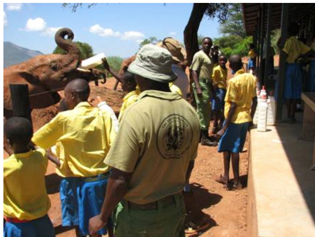
Kajire students meet the elephant orphans at Voi