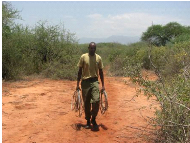
Big snares lifted at Mbulia Ranch