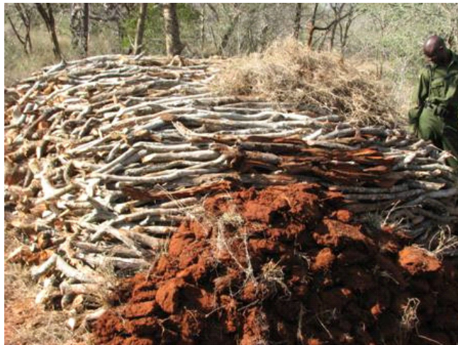
Charcoal burning at Sagalla Ranch