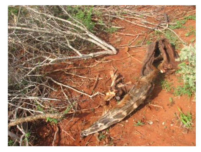
Remains of a poached giraffe