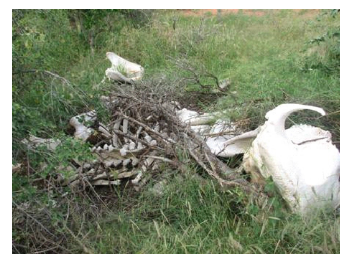
A second poached elephant at Dakota ranch