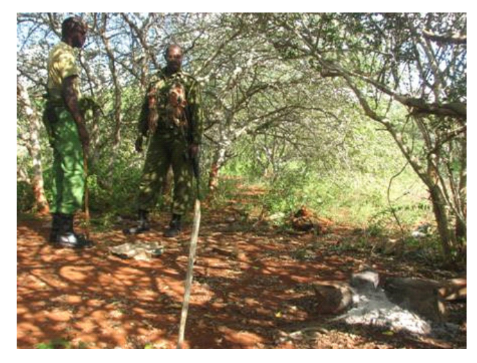
Fresh poachers hideout at Kizingo ranch