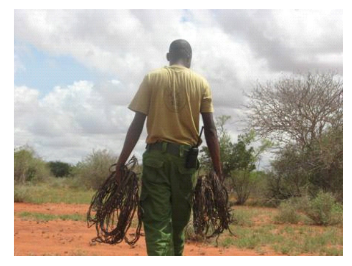
Snares lifted at Kulalu ranch