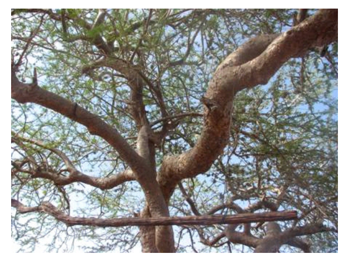
A snare targeting Giraffes