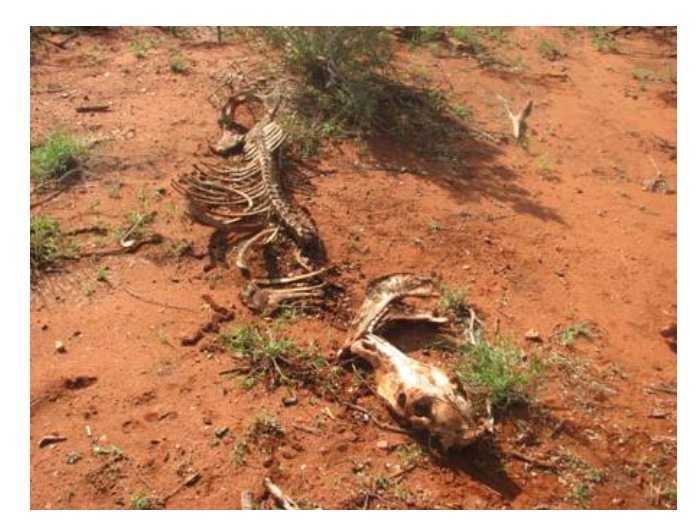
Poached zebra at Kulalu ranch