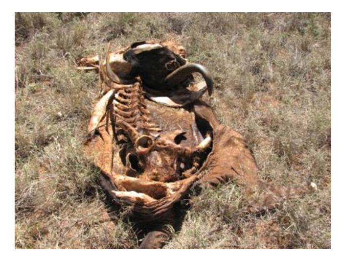
A poached buffalo at Ndii