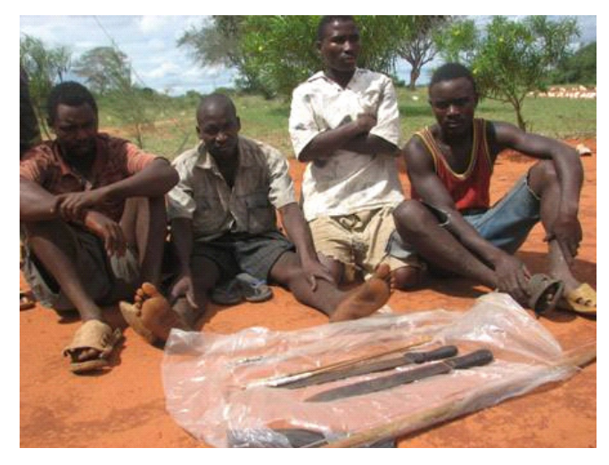
Poachers arrested at Kizingo ranch with poisoned arrows