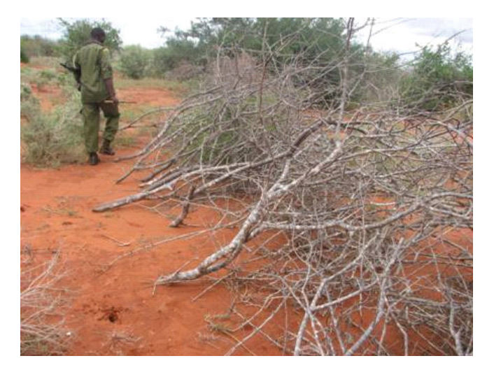
The Team patrols the snare fence at Kulalu Ranch