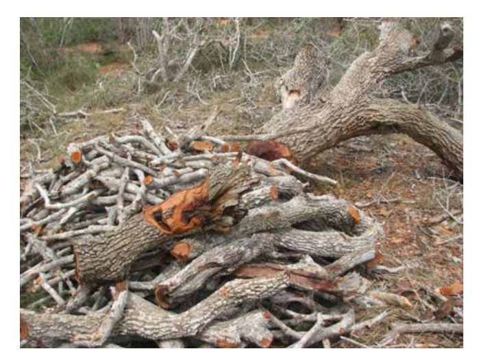
Logging at Dakota ranch