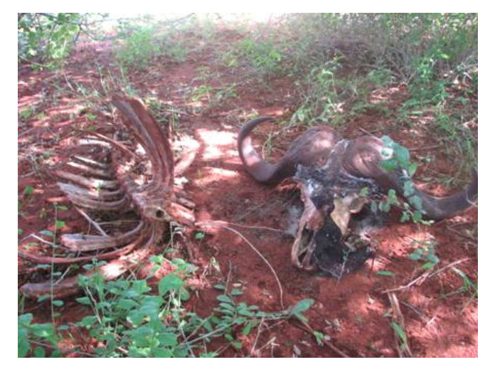
Poached buffalo at Kulalu Ranch