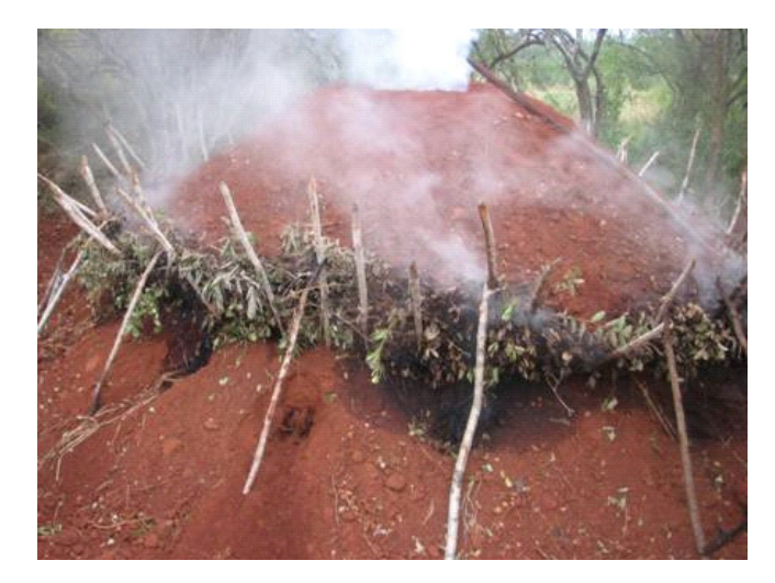
Illegal Charcoal kilns