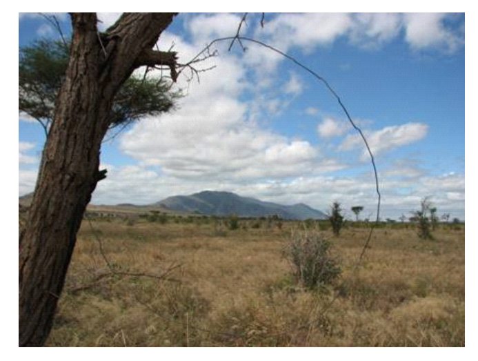
Large cable snares at Ndii