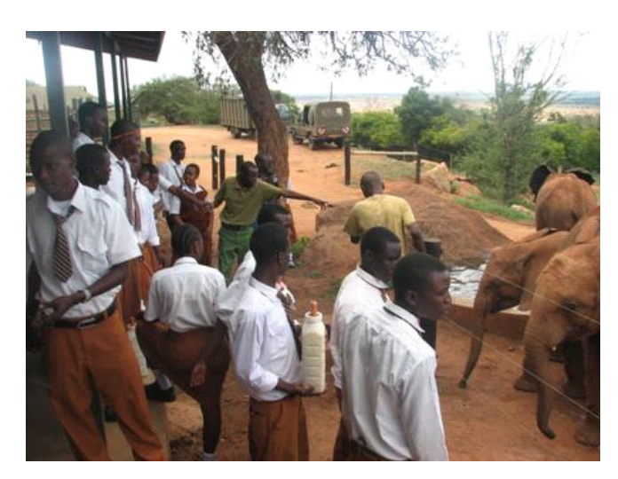
Kajire students visit the elephant orphans at Voi