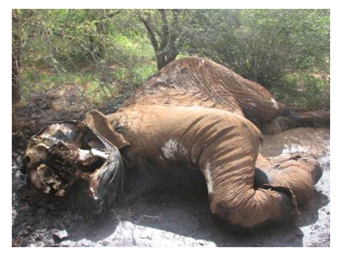
A poached elephant at Dakota ranch