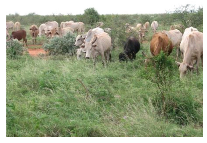
Cattle grazing at Ngutuni Ranch