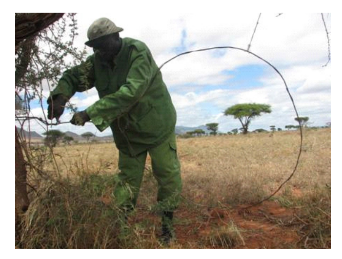
Team members lifitng snares at Ndii