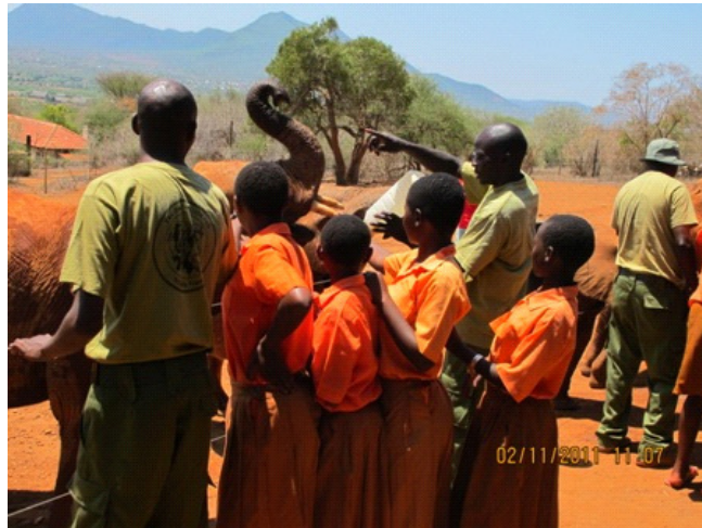
Mwambiti students visit the Voi orphans during their school trip