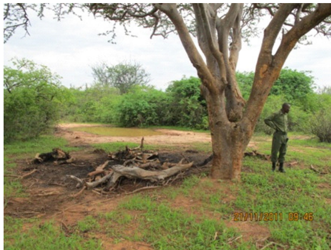
Elephant carcass at Mbulia ranch