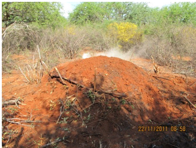
Charcoal burning at Mbulia Ranch