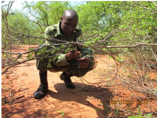
Lifting small snares at Mbulia ranch