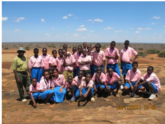
Miasenyi pupils visit the Mudanda rock