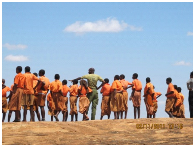
Mwambiti pupils visit the Mudanda rock