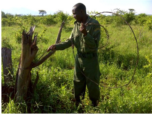
The Team removing large snares at Ndii