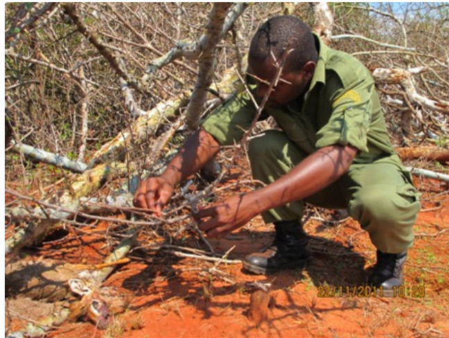
The Team find a snared Dikdik