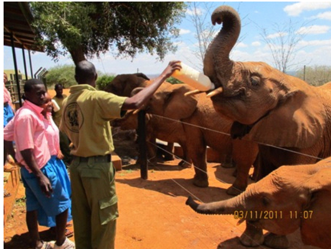
Miasenyi pupils meet the Voi orphans and learn about elephants