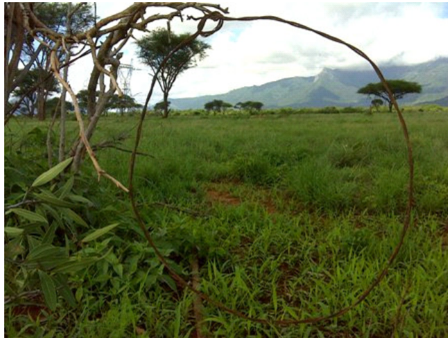
Large snares found during patrols