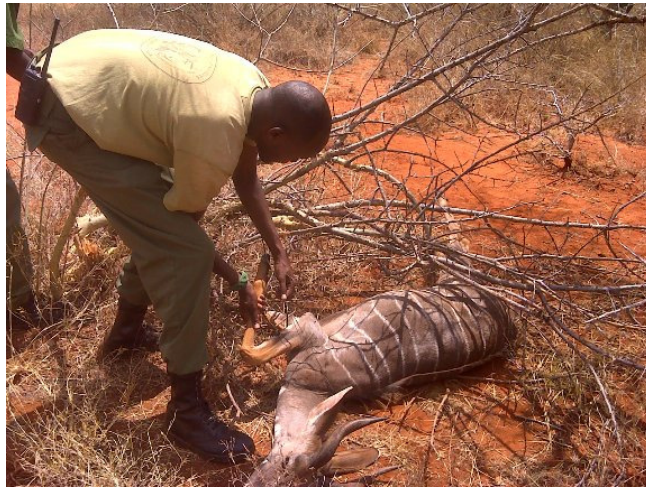
A snared Lesser Kudu found at Sagalla