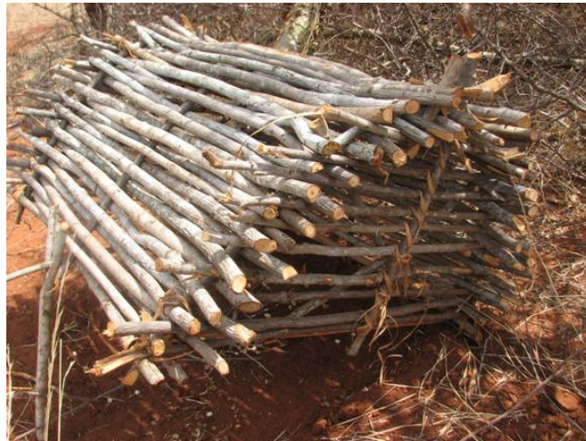
A bird trap recovered at Sagalla Ranch