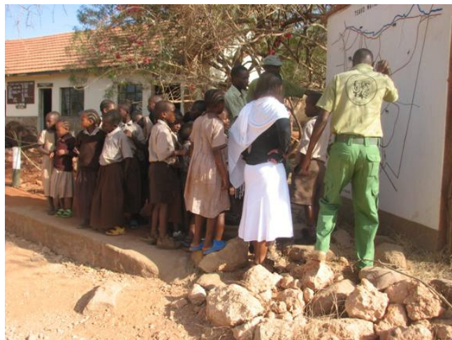
Kileva students visit Tsavo East National Park