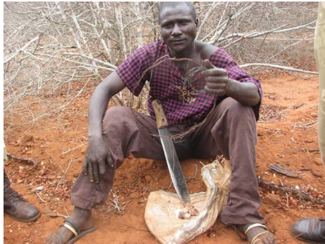
A poacher arrested at Sagalla Ranch