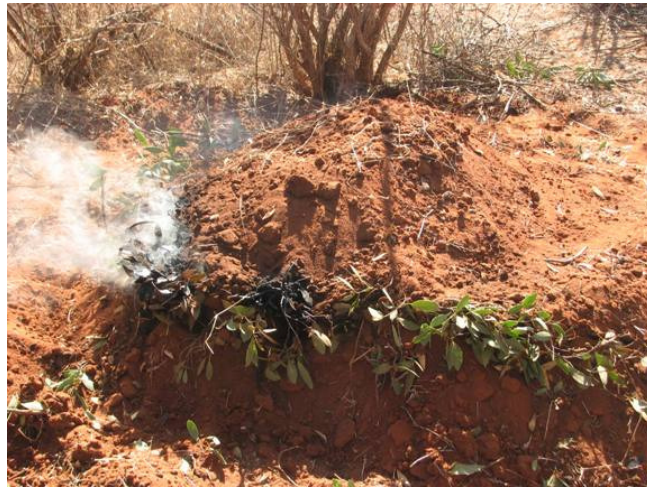
Many charcoal kilns seen at Mbulia