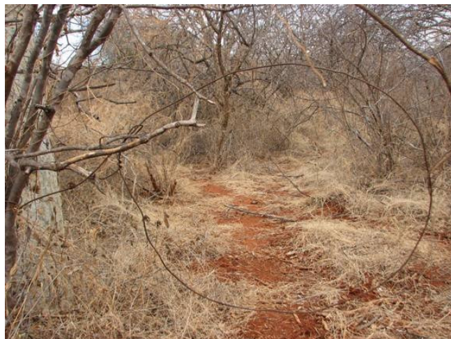
A large snare at Mbulia Ranch