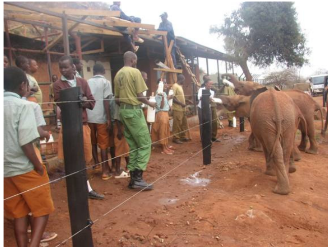
Gideon Mosi School pupils visit the elephant orphans