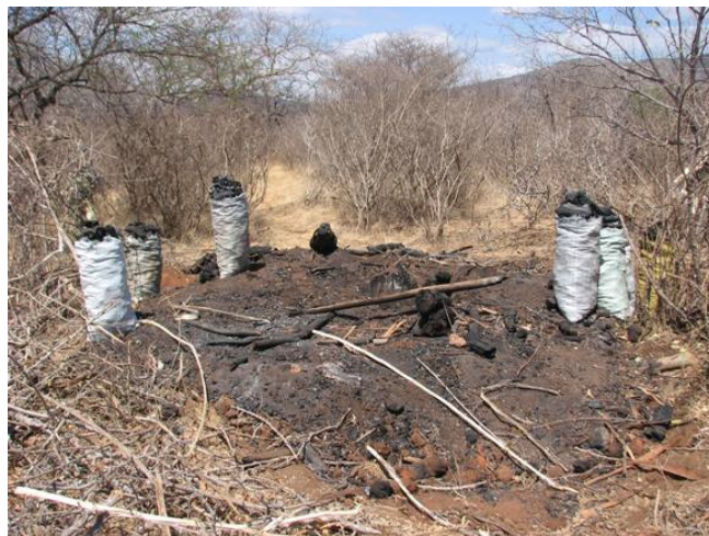
Charcoal burning at Mbulia