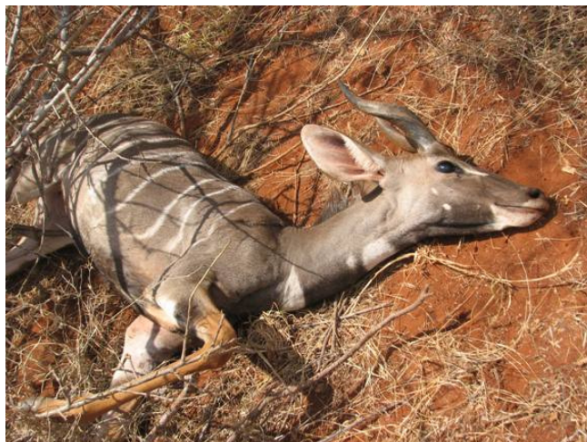
The snared Lesser Kudu found at Sagalla ranch