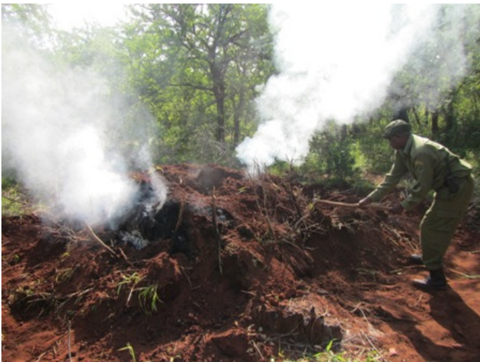
Above: the team destroying illegal charcoal kilns