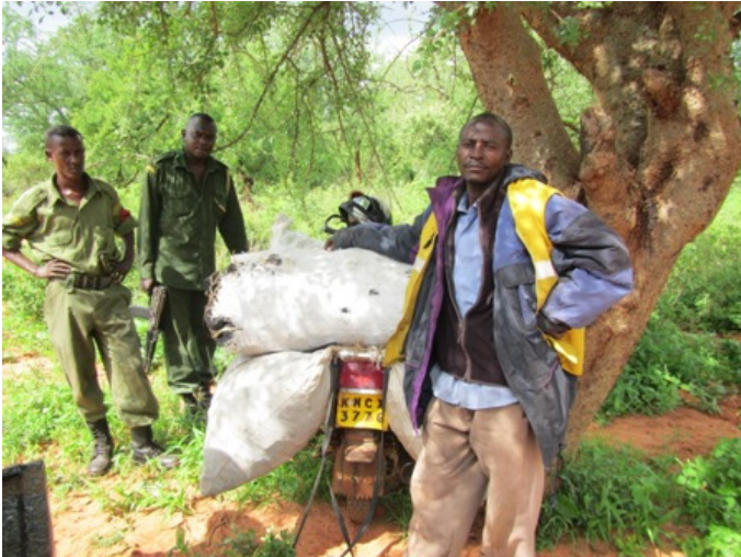
Above: a charcoal burner arrested in possession of sacks of charcoal being transported to the market