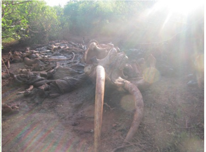
Above: the carcass of a elephant with tusks intact is found. The tusks were removed and given to KWS