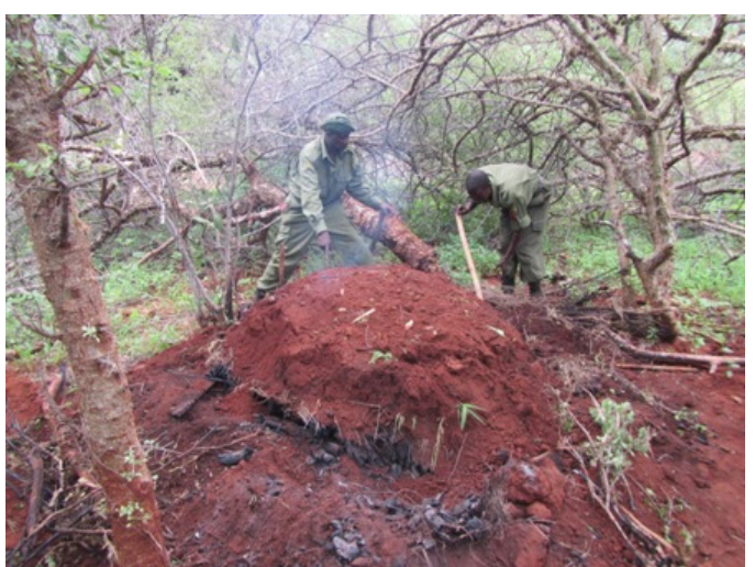
Above: the team destroying illegal charcoal kilns