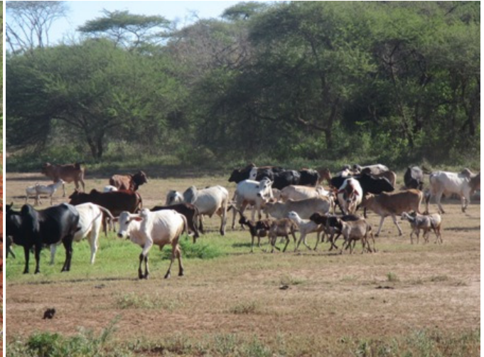
Above: illegal livestock grazing inside the Park