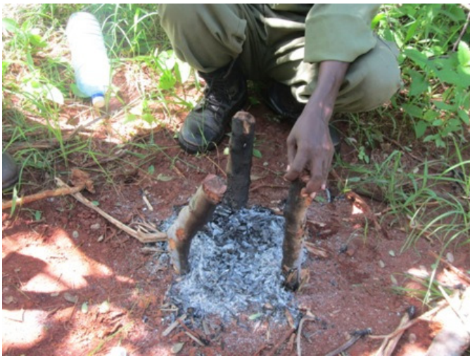
Above: a recently used poachers camp