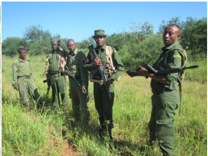
Above: the Chui team members on patrol