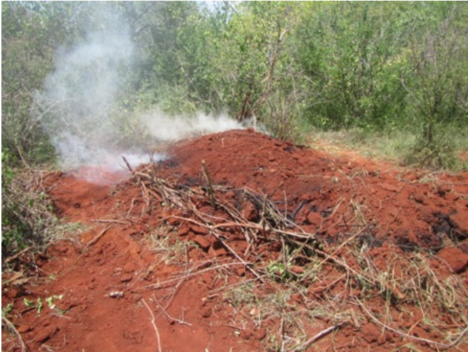
Above: an illegal charcoal kiln