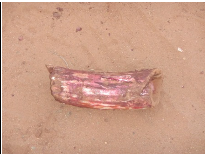
Piece of ivory left by poachers at Kalawa.