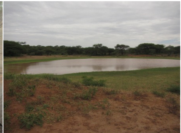
Waterhole seen at Mangelete during patrol.