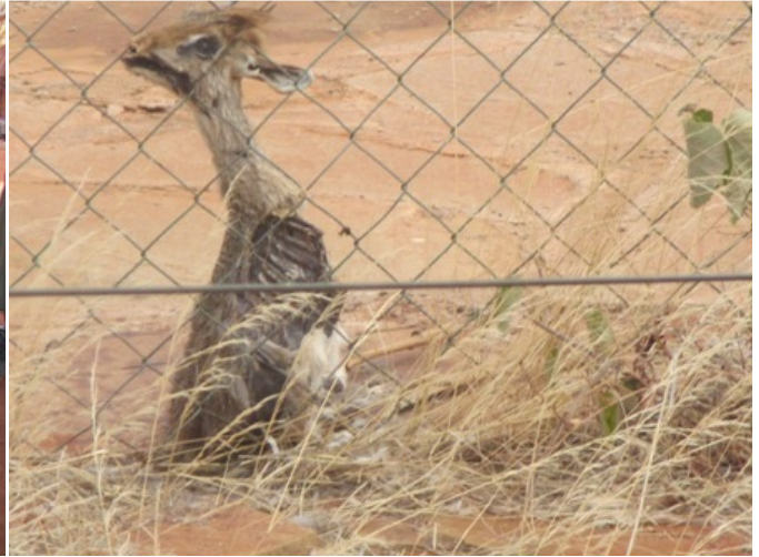
A dikdik trapped in the fenceline.