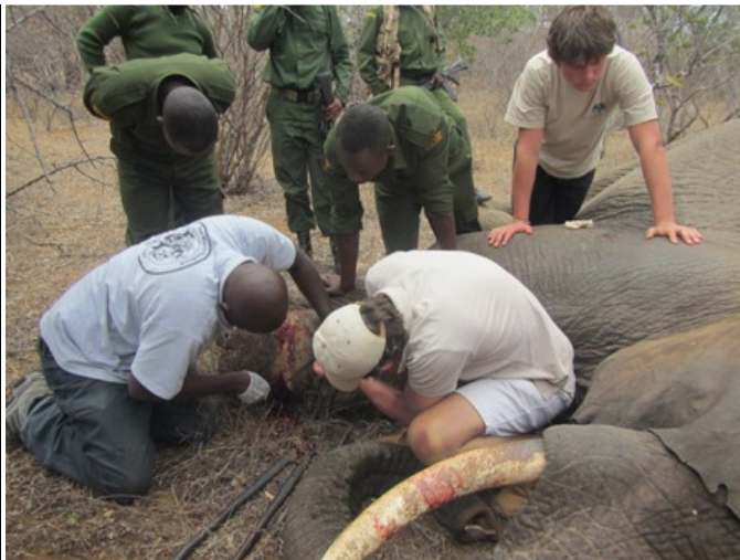
The team with the vet unit attending to a snared elephant at Triangle area.