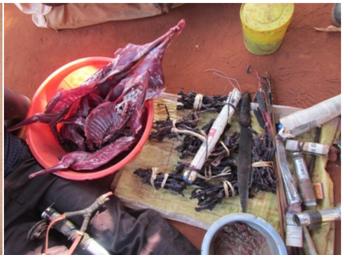
Dried bush meat with hunting apparatus.