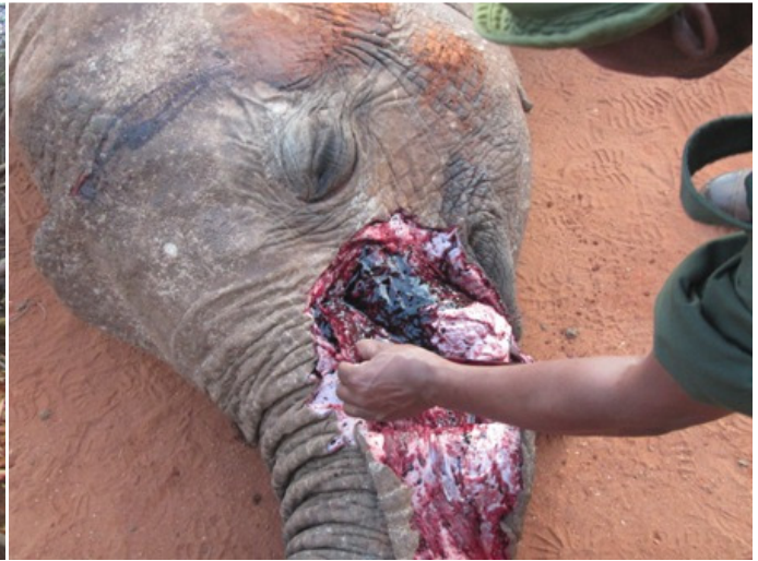
A freshly poached elephant carcass at Kalawa