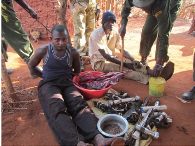
Poachers arrested at Kilalinda arrow from the