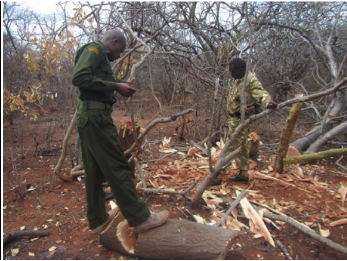
Logging sighted in the triangle area.