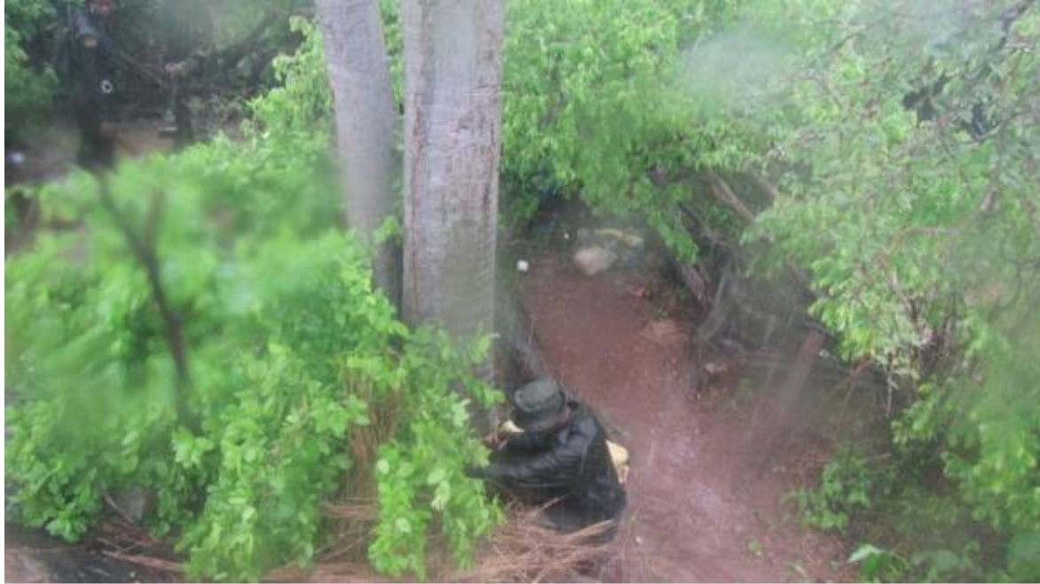
Items recovered by the Mtito Team in the poacher hideout, including bows, arrows and poison