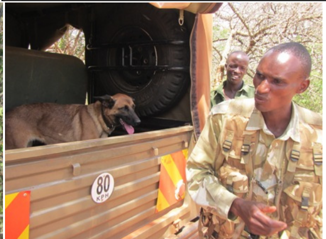
Above: A track dog in a desnaring truck in triangle area