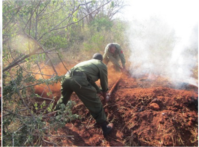
Above right: The team destroying charcoal kilns in the triangle area.