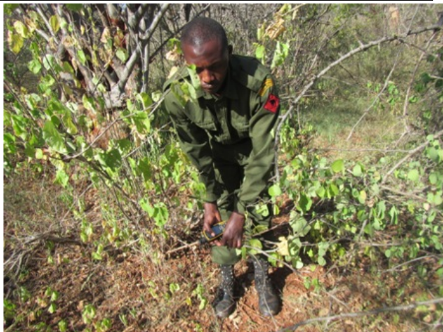
Above: Chui team leader lifting up a snare.