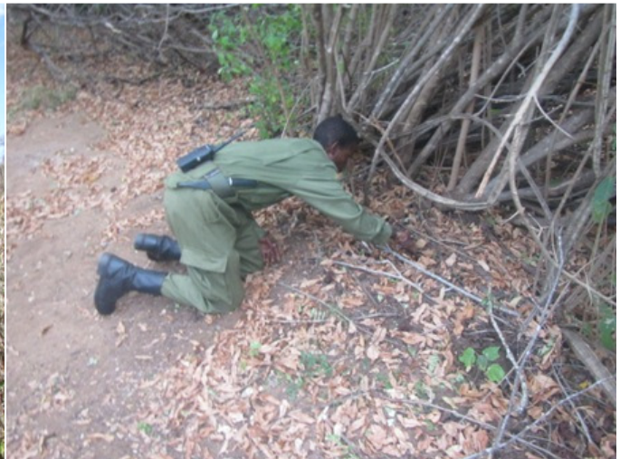
Above: Chui team member examining a poacher's camp at Kanga area.