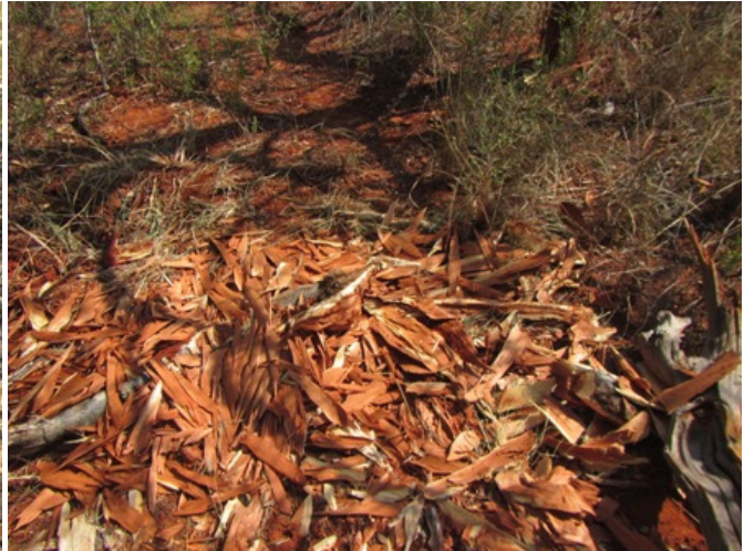
Above: Logging around the Triangle area.