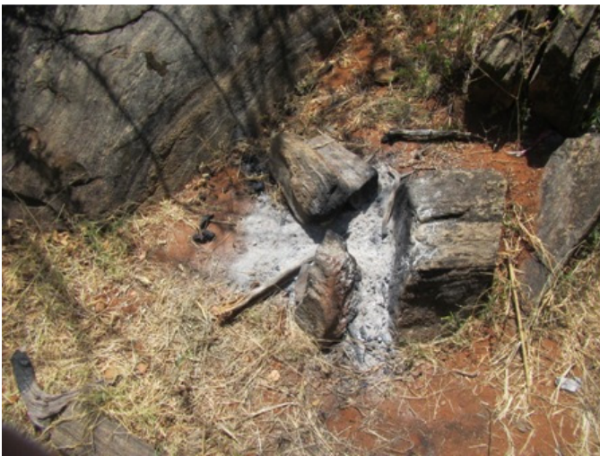
Above: A destroyed snare around Kiboko area.