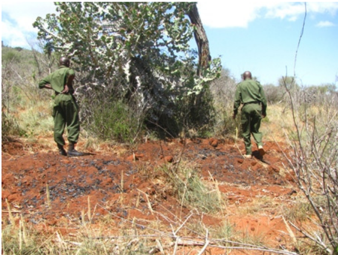
Above: Charcoal burning at Saltlick ranch