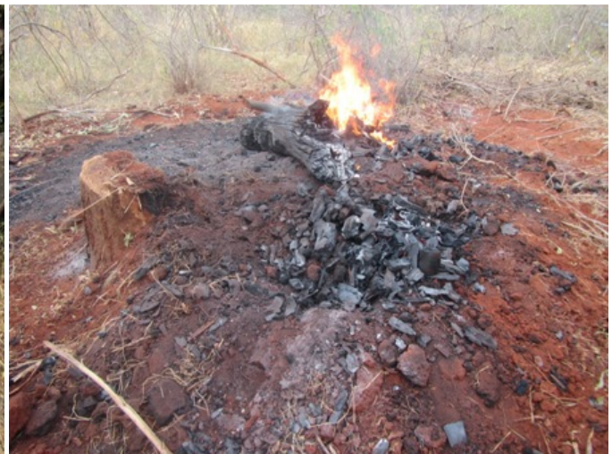
Above: A charcoal kiln around the triangle.