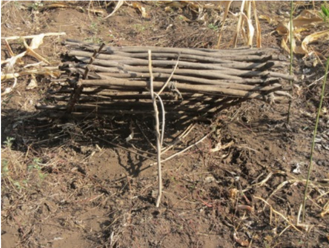
Above: A bird trap found at Mang'lete area.