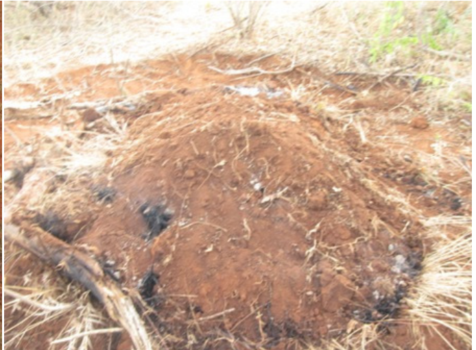
Above: Charcoal Burning at triangle area.