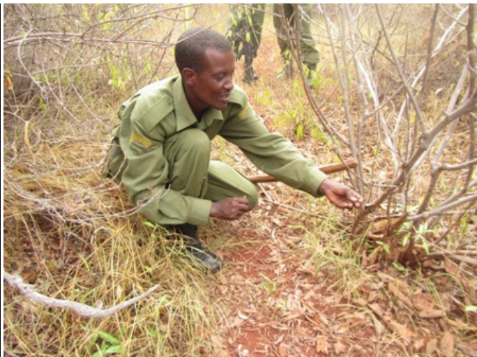
Above: Desnaring at Ngiluni Area