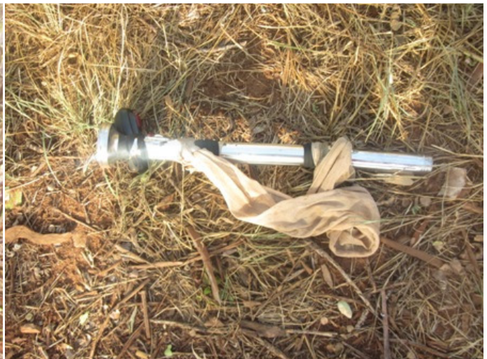
Above: Lamping tool found at Ngiluni.