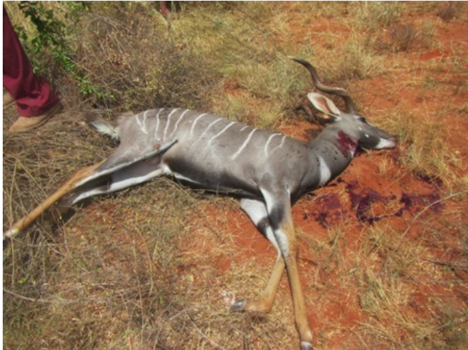
Above: A lesser Kudu ran over by a vehicle.