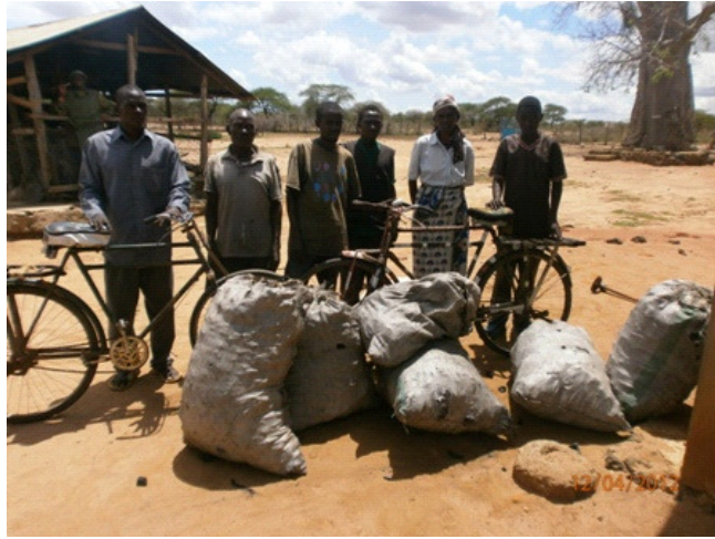
Arrested charcoal burners