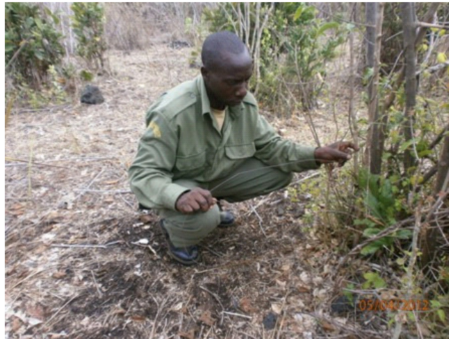
A team member removing snares