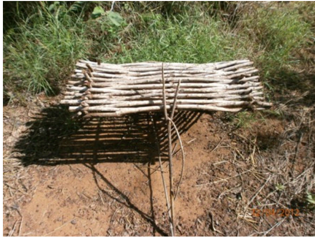
A Guinea Fowl trap, Ndua area.