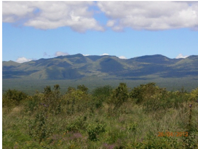
The Chyulu Hills National Park from a distance