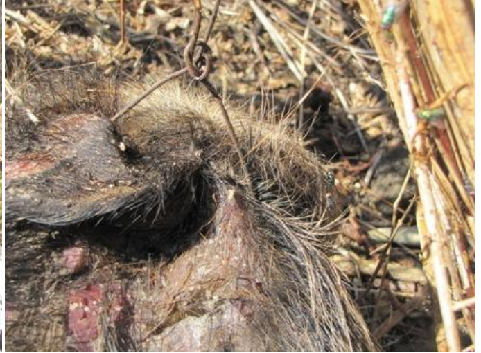
A snared warthog carcass at Kikunduku area.