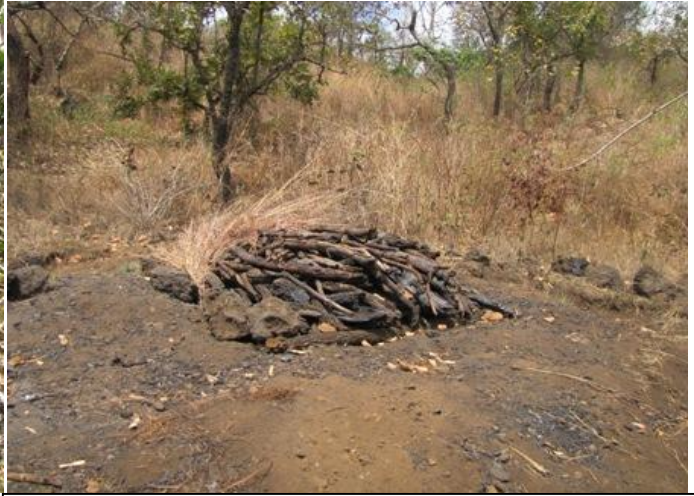
Unfinished charcoal kiln at Kikunduku area