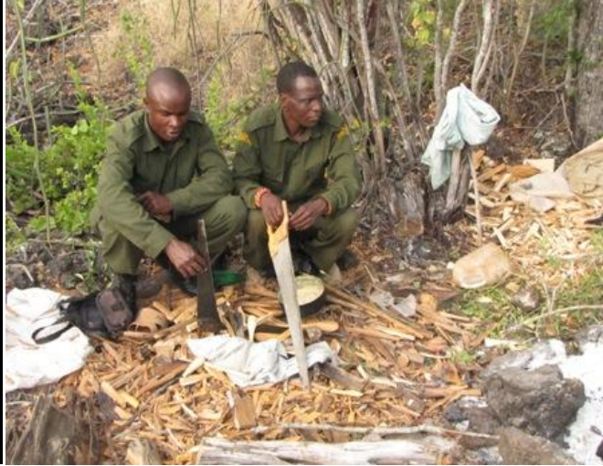
Wood carvers hideout at Mukururo area