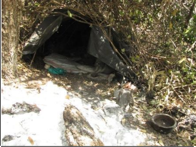
Poachers' hideout at Kikunduku area.