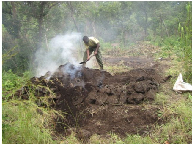
A team member destroying an illegal charcoal kiln