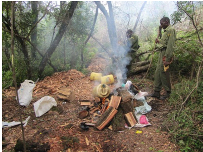
The Team destroys a wood carving hide