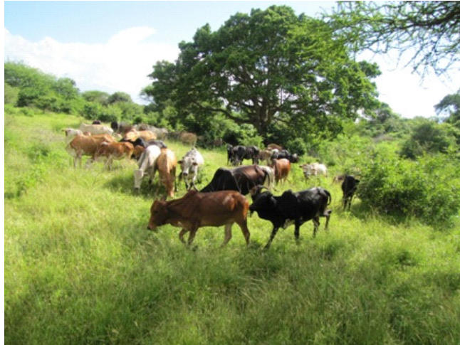
A herd of cattle in park, Nzuoni area