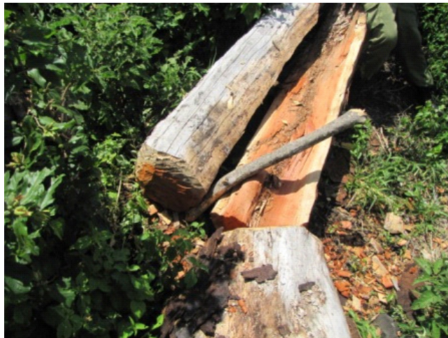
Illegal logging at Metava area