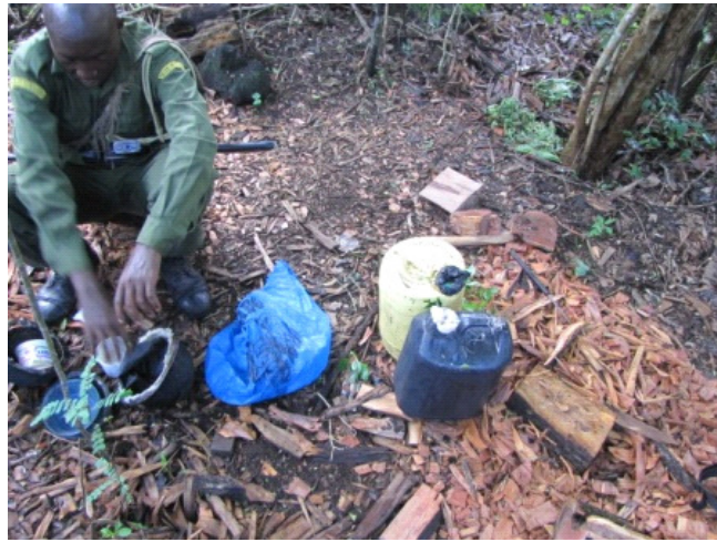
Wood carvers' hideout at Kisula area