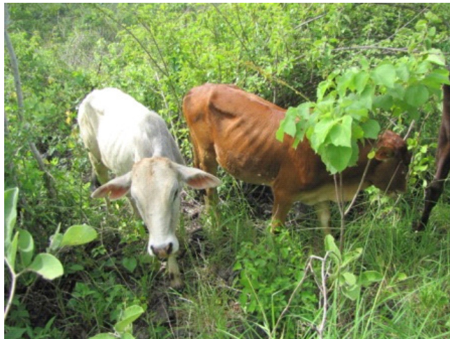
Illegal grazing at Metava area