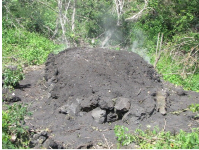
Charcoal burning at Metava area