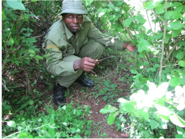
Lifting snares at Kibwezi Forest