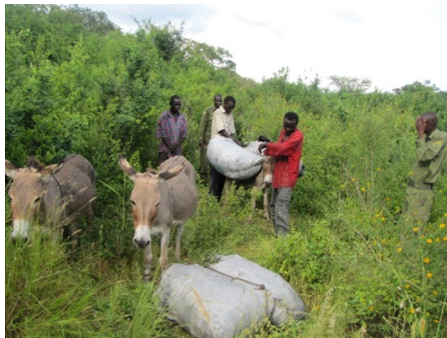
Arrested charcoal burners at Ngiluni area