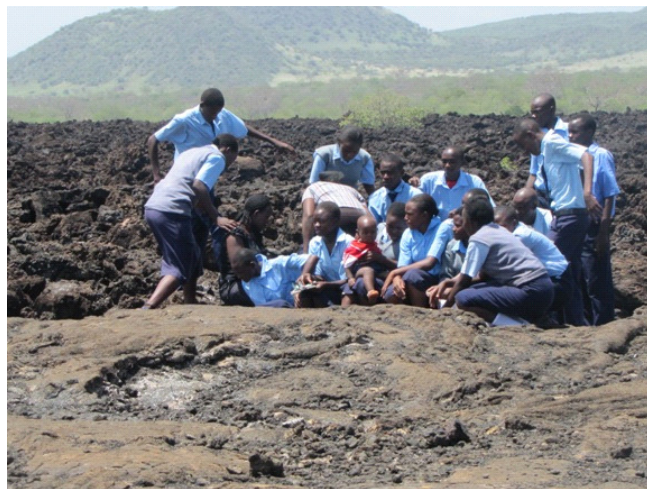
Missuni secondary pupils at Shetani lava