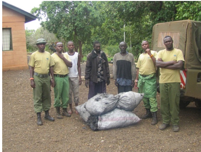
Arrested Charcoal burners