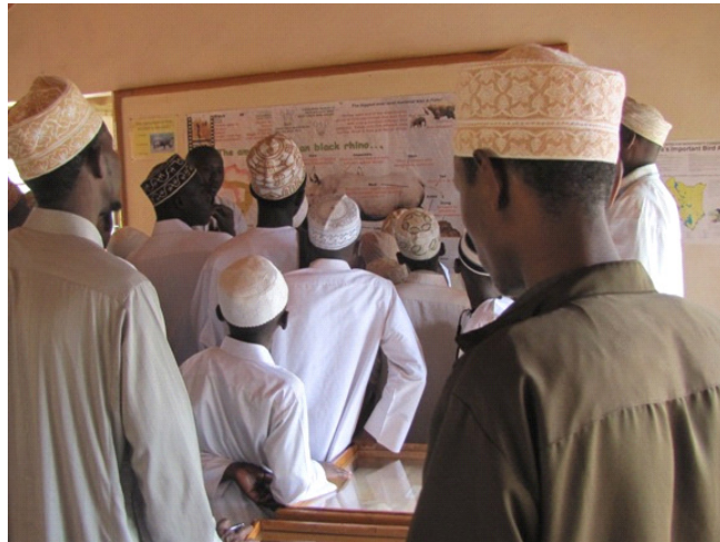
Makindu primary at information centre