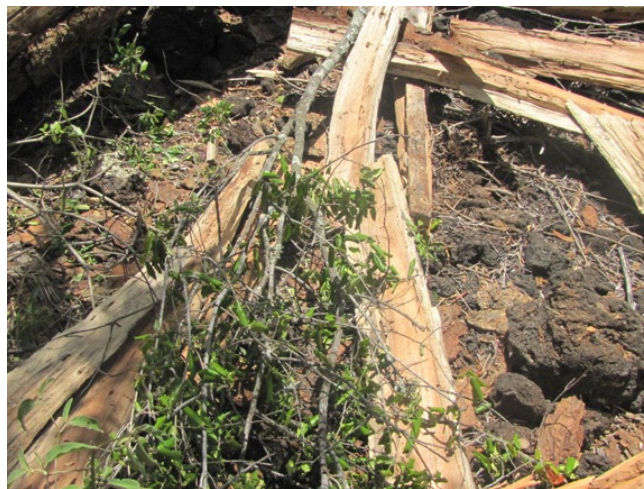
Illegal logging in Kiboko area