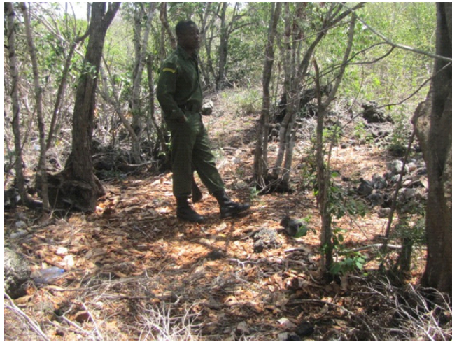
Wood carvers hideout