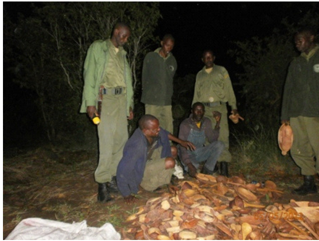
Wood carvers apprehended, Kenzili fenceline area