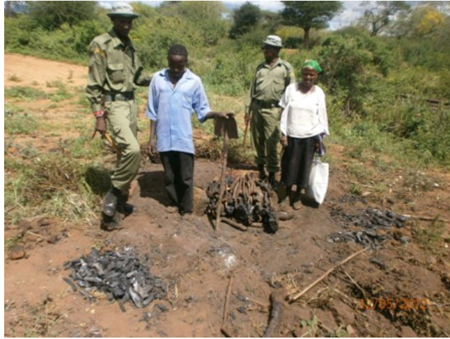
Arrest of charcoal burners