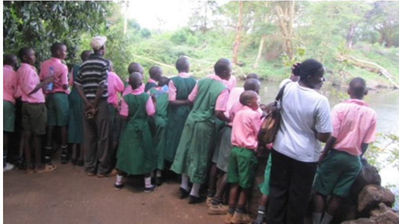
Kithasyu students at the Mzima Springs