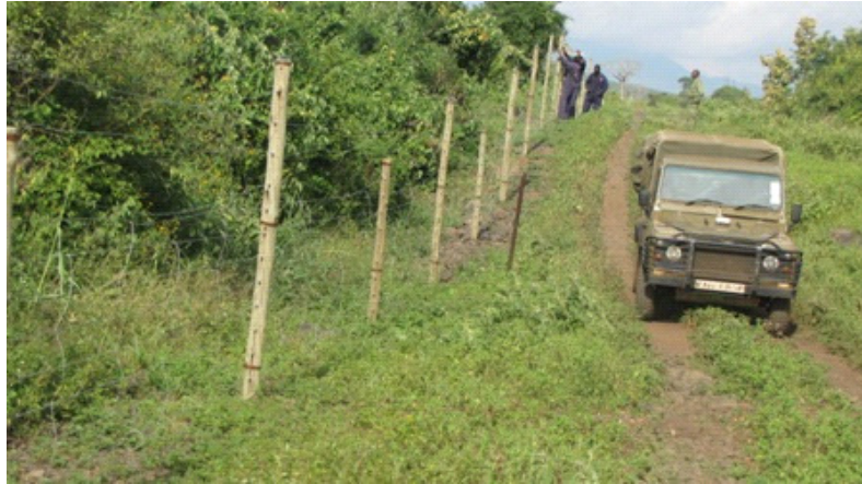
The team check on the new fence line project