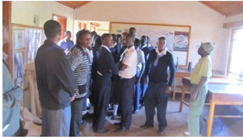
Mikuyuni students at the Information centre, Tsavo West National Park