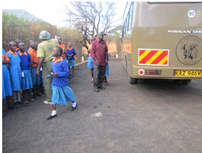
Maikuu primary school pupils at information centre