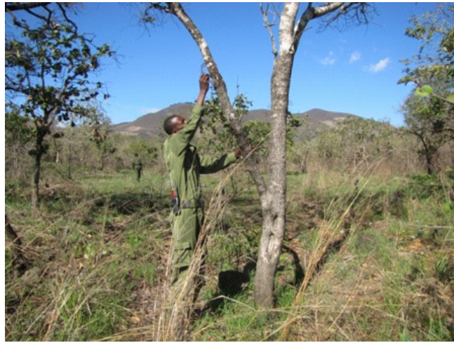
Lifting snares targeting giraffe