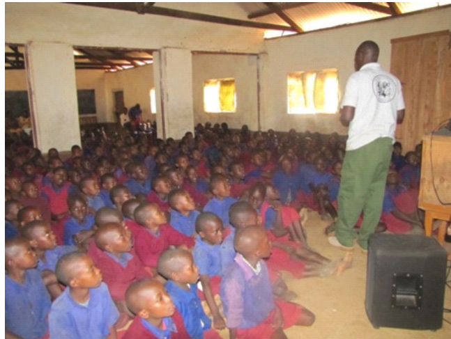
Muusini primary school video show