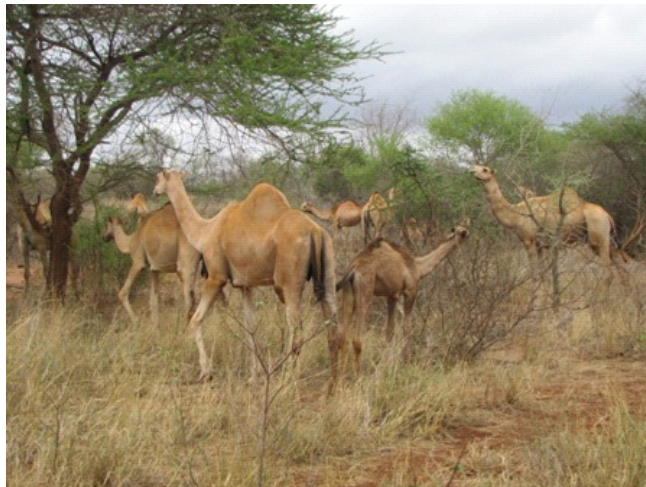
Illegal livestock grazing