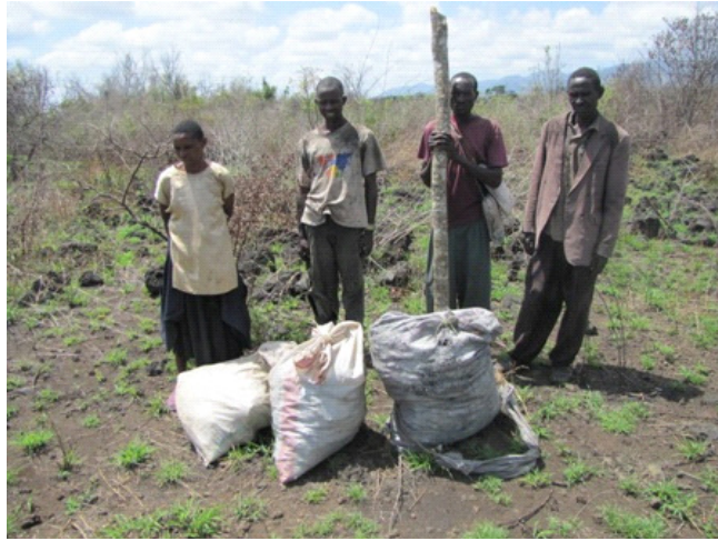
Arrested charcoal burners at Kikunduku