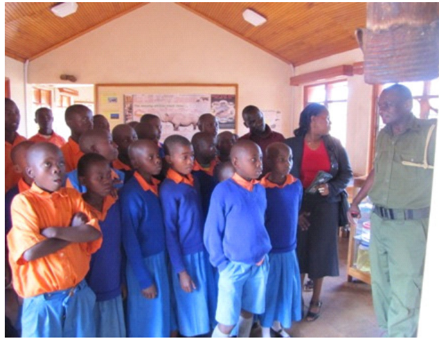
Maikuu primary school pupils at information centre