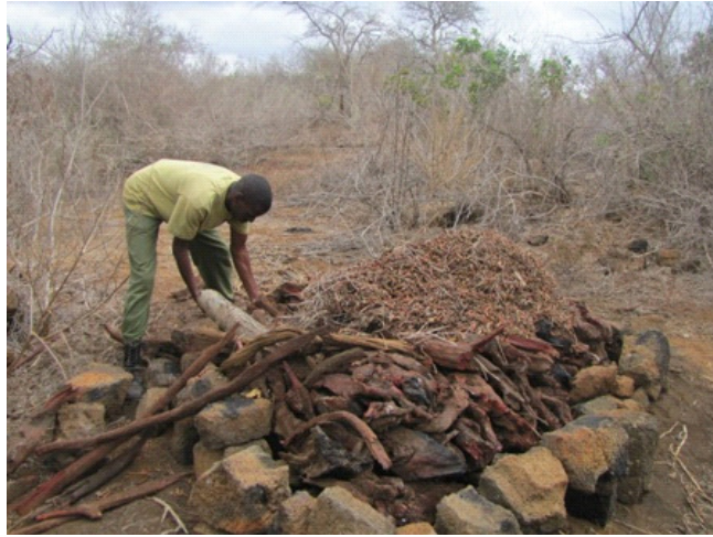
Illegal charcoal kiln