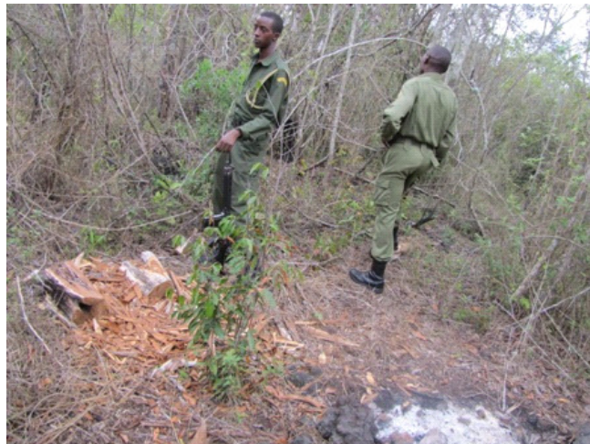
Wood carving hide at Kisula