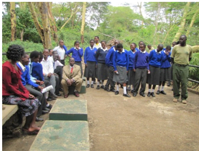
Ngomano pupils at Mzima springs