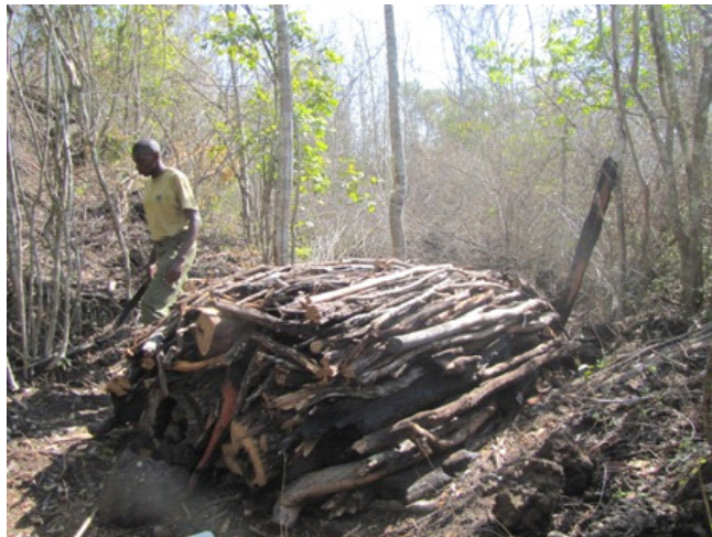
Illegal charcoal kiln at Kikunduku