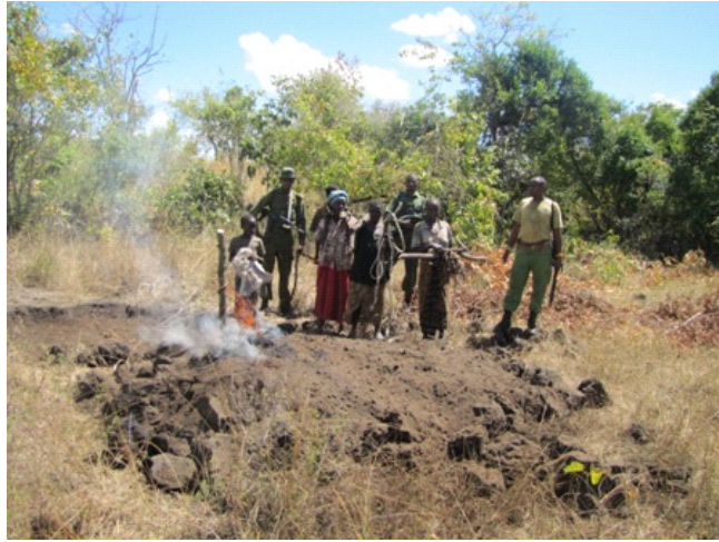
Arrest of illegal loggers and charcoal burners in the Kikunduku area