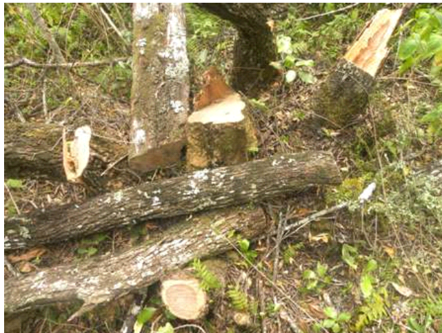
Illegal logging at the Mbotela area