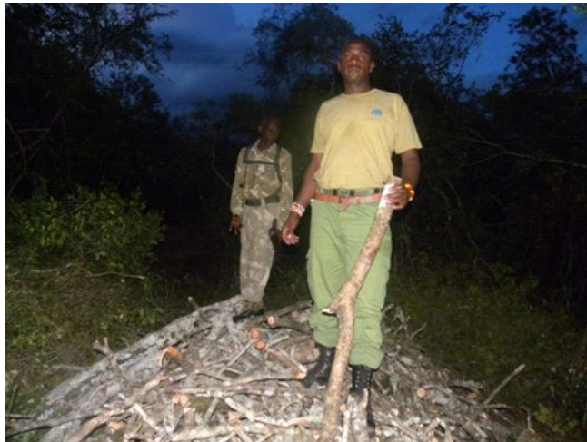
Illegal logging at Kathekakai