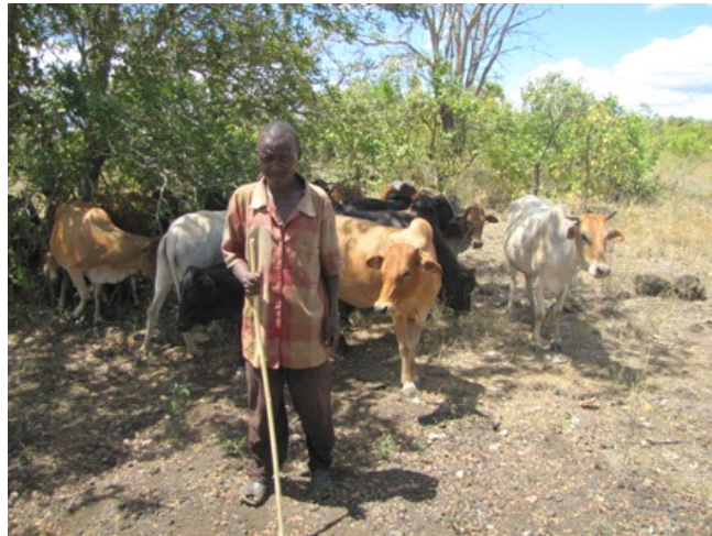
Illegal Cattle grazing at Kikunduku area