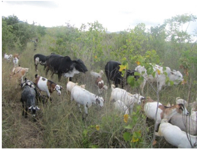
Livestock inside the park at Kathekakai area