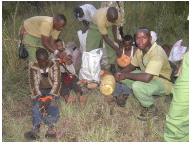
Arrest of wood carvers at the Kathekakai area