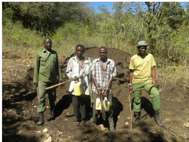
Arrest of charcoal burners in the Kikunduku area