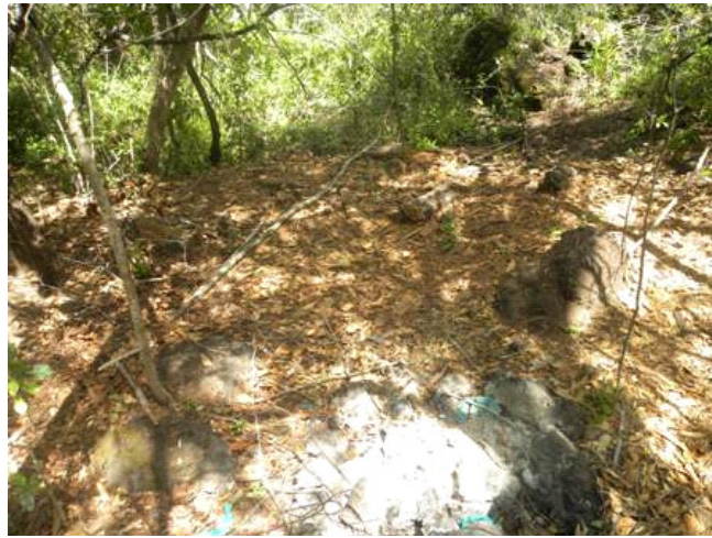
Wood carvers hideout at Mbotela area