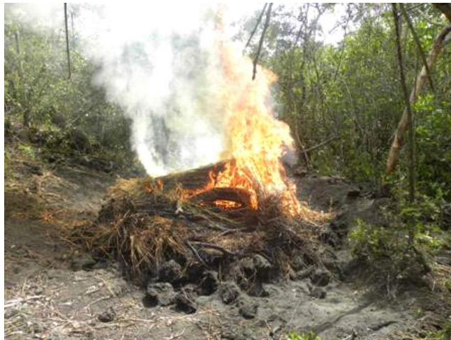
Team destroying charcoal kilns at the Mbotela area