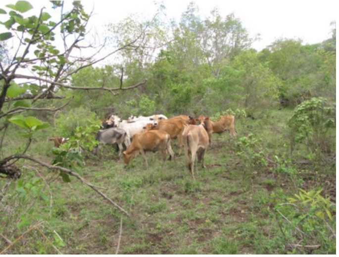
Above: illegal livestock grazing in the National Park, a big threat to the Parks vegetation cover