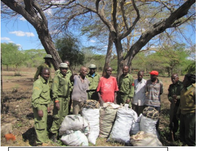
Above: charcoal burners arrest in KARI area