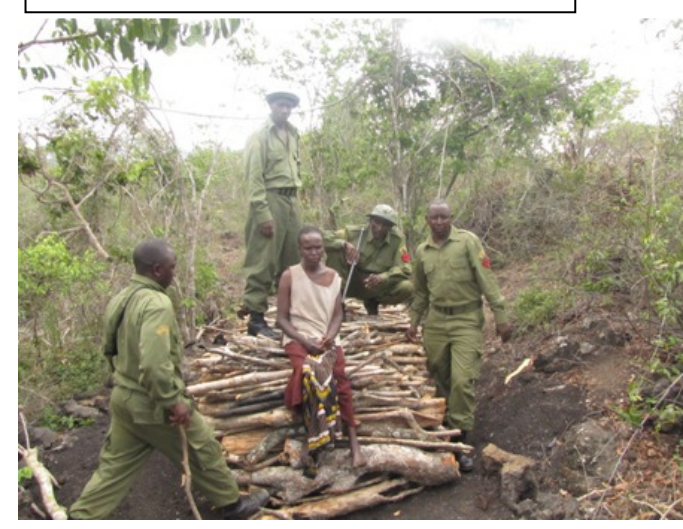
Above: arrest of a man preparing an illegal charcoal kiln

Above: the arrest of charcoal burners in Kithasyo