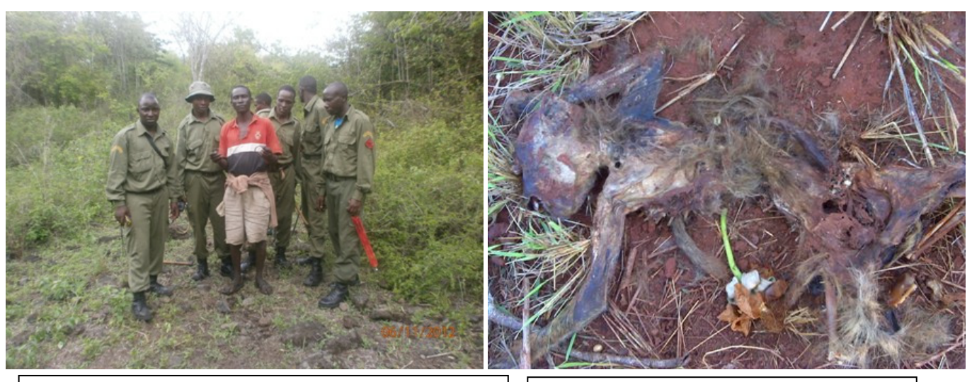
Above: the arrest of a poacher caught red-handed setting snares in the Park