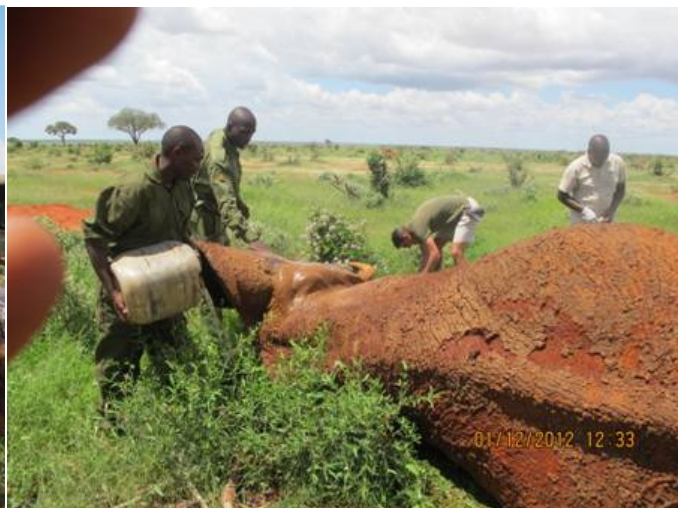
Above: the team assist the Tsavo Mobile Veterinary Unit with the treatment of a bull with arrow and snare injuries to the leg on Galana Ranch