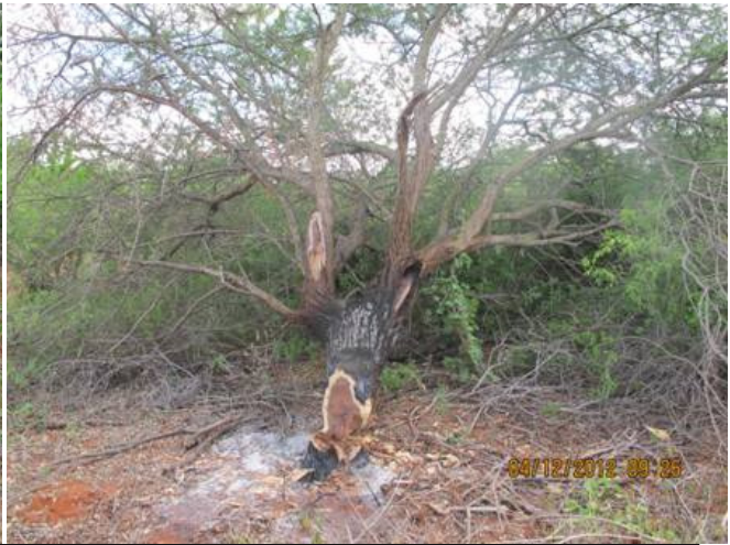
Above: logging at Mbulia Ranch, logging of indigenous hard woods is a huge threat to the forest cover in the Tsavo ecosystem