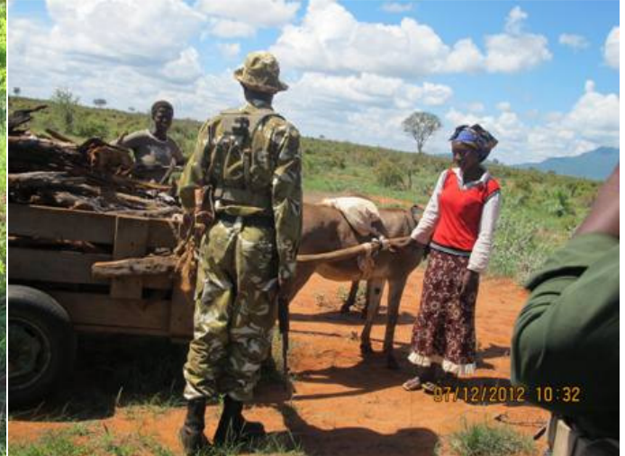
Above: the arrest of people collecting fire wood without a permit