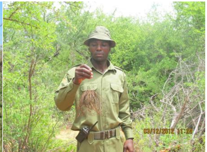
Above: thin wire snares lifted at Mbulia, such snares are very efficient at killing small game such as dikdik