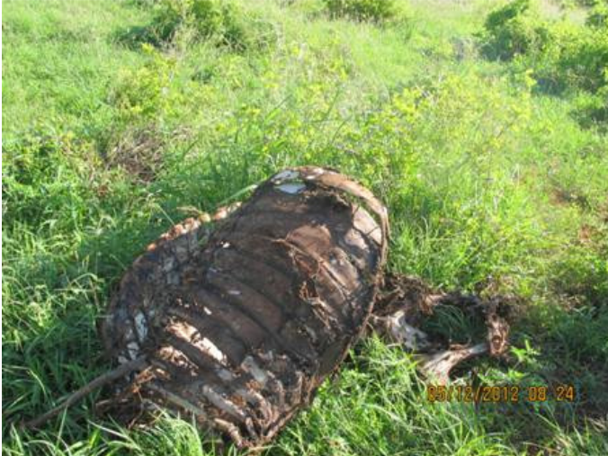
Above: buffalo carcass found on lion hill