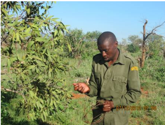
Above: removing snares in Ngutuni