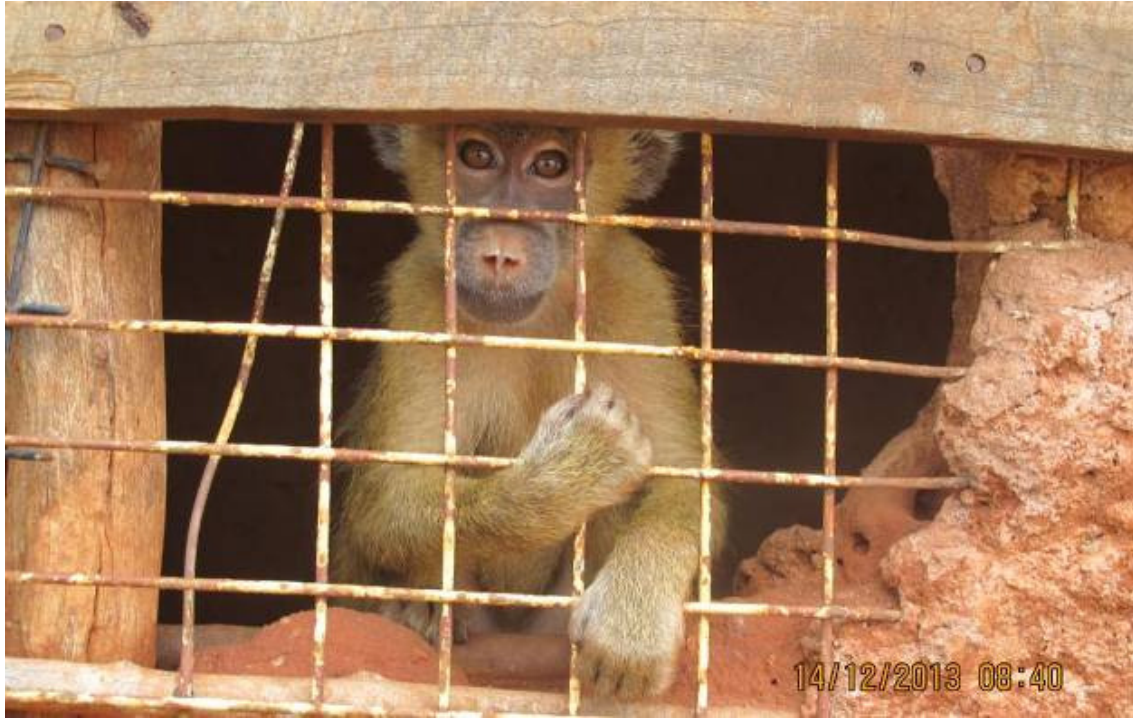
Moses, the Bura Team Leader and Southern area Team Leader discovers the case of a baby baboon in captivity in Voi town