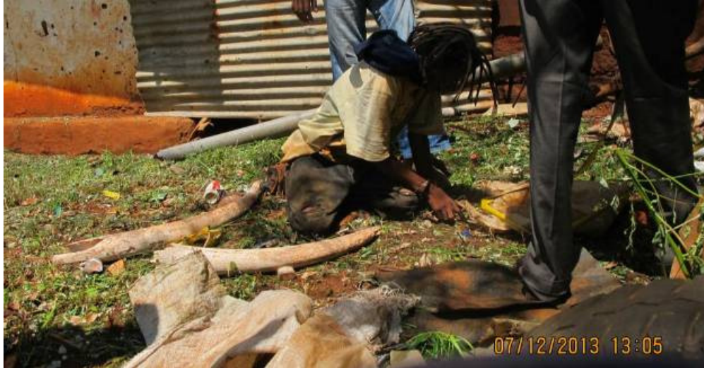
Ivory and python skins recovered from illegal dealers