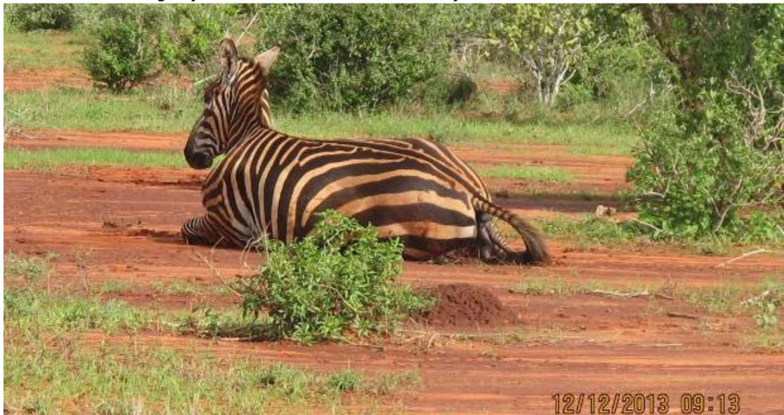
A zebra lies down to give foal while the Bura team observes from a distance