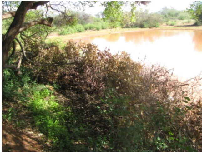
Poachers shooting hideouts near water sources in the park