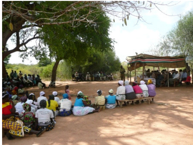
The community members listen to the leaders