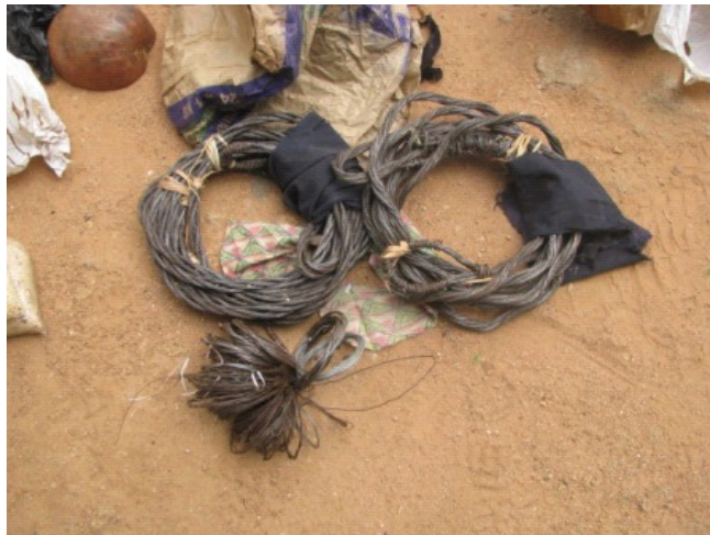
Large cable snares used to target elephants and other large game