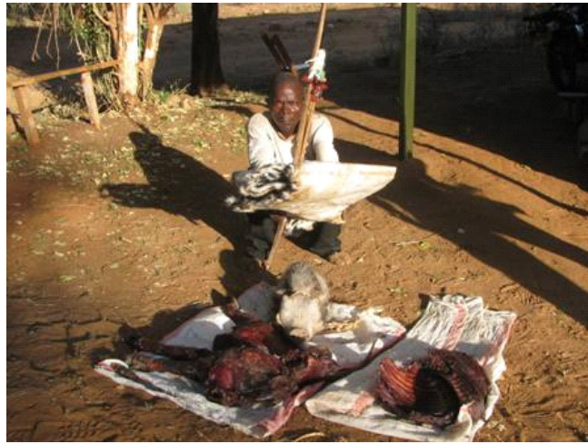
Poacher arrested with bushmeat and cheetah skin in Mutha