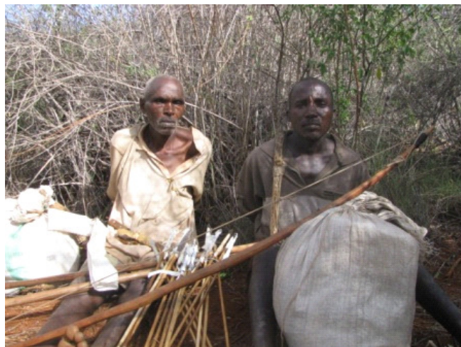
Arrested poachers near rock-waterhole umauma