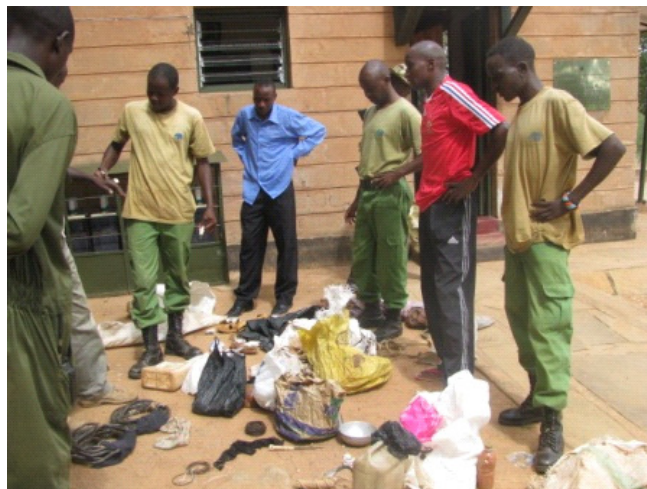
The Poacher's belongings being recorded before storage