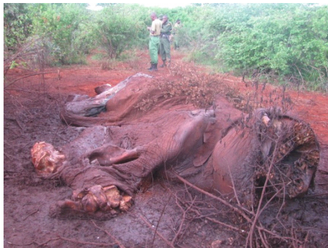
Poached elephant in the Park, killed using poison arrows