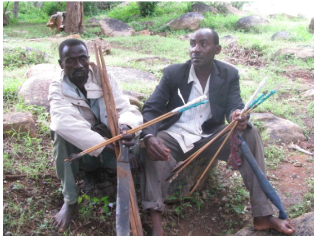
Suspected elephant poachers arrested