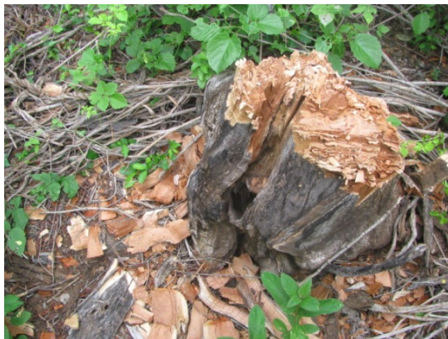
Logging in the Park