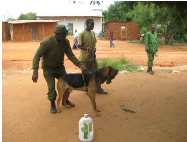
The tracker dog identifies the thieves homesteads