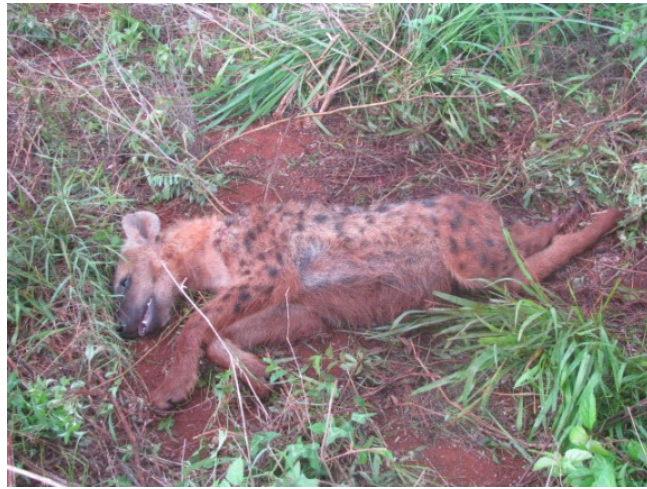
Hyena dies after eating poisoned elephant carcass