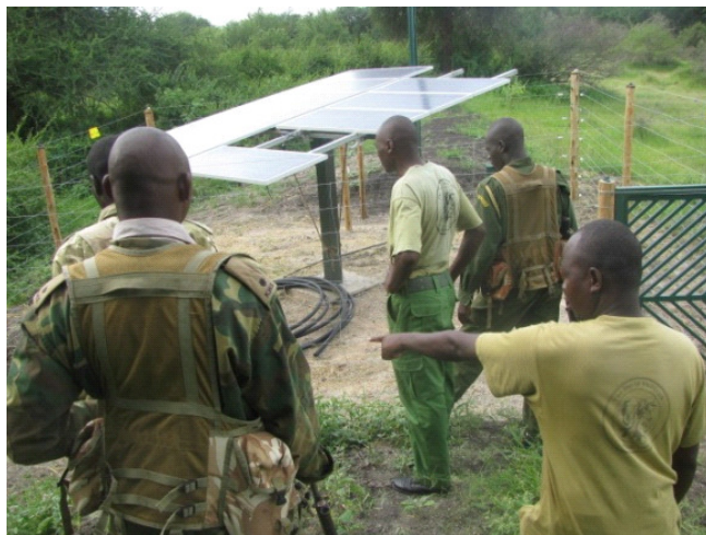
Solar panels stolen at borehole site