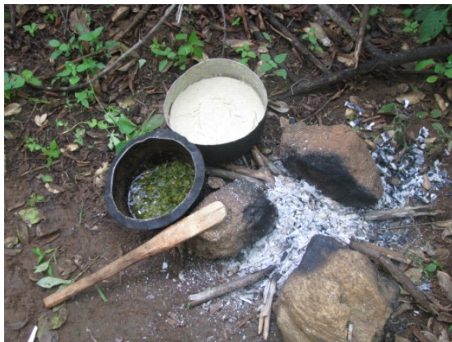
Poachers hideout at Kyae-rock