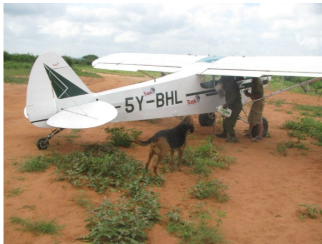
Tracker dog brought to assist with the investigation