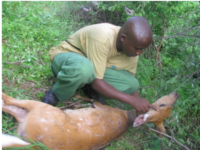
Snared pregnant bushbuck dies at the Team member tries to rescue her.