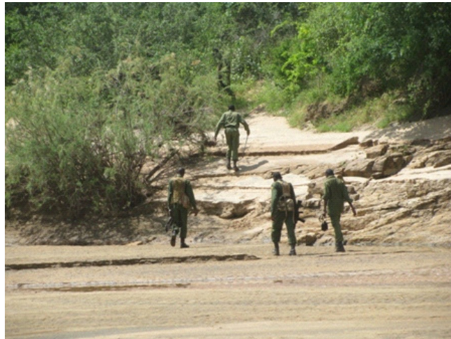
De-snaring team during patrols