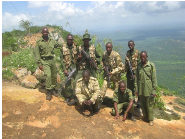
The Team with the KWS Rangers on Ithumba Hill