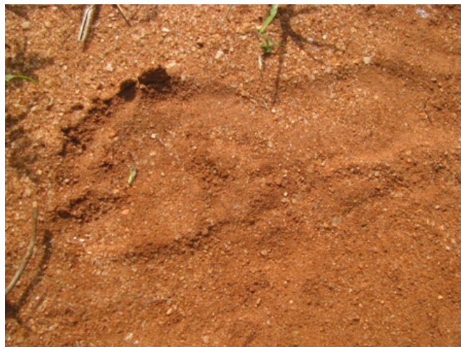
Fresh poacher footprint at Mathae area