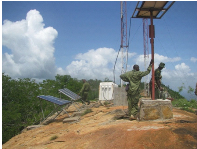
Repair works at the Ithumba repeater