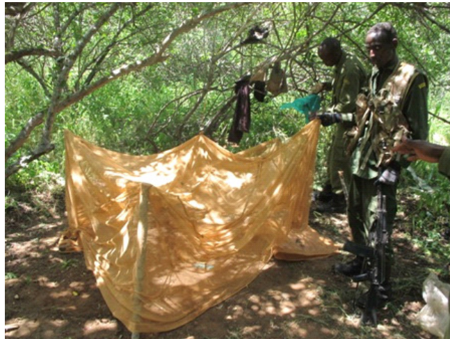
Recently used poacher camp is destroyed at machokobo area