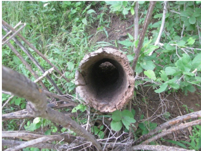
Man made beehive seen inside park yatta area