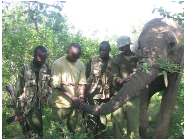
Kora the orphan who was injured by poachers greets the Team