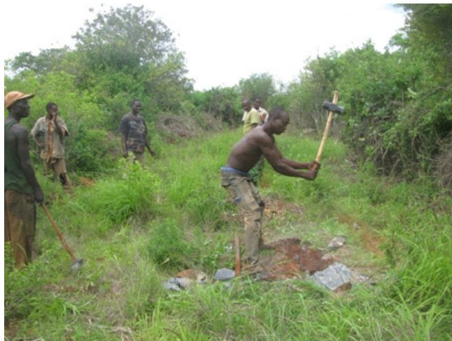
Casuals working on opening the road at Yatta