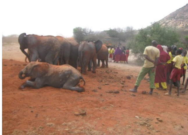
Kone Students learn about elephants & conservation