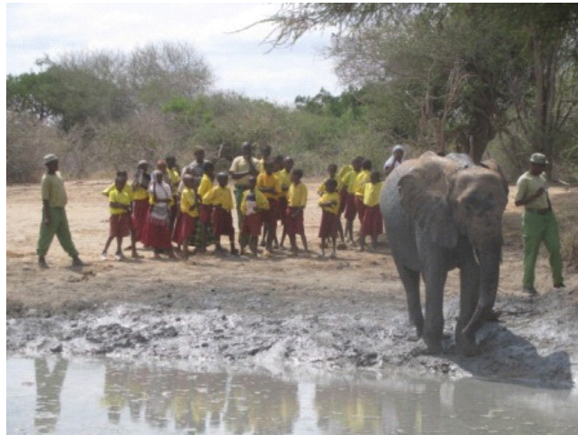
Kone Students visit the Ithumba elephant orphans