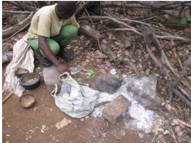
An active poachers camp near kyae rock