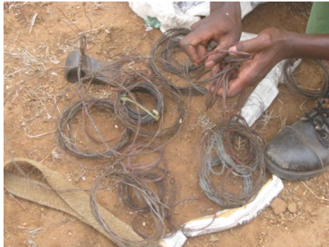
Snares siezed from poachers