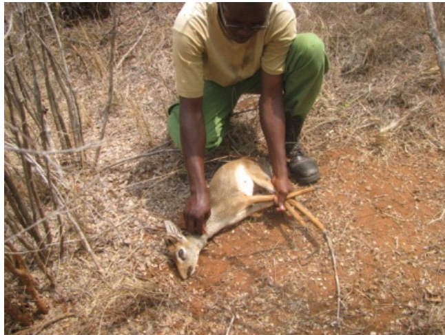
Rescuing a Dikdik from a snare