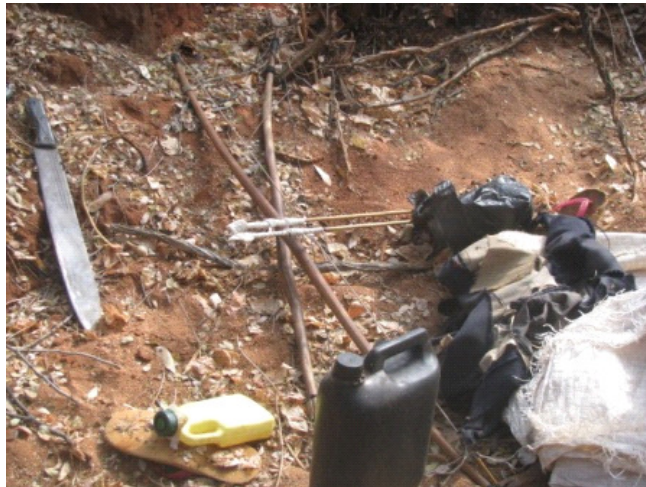
Poachers hiedout in Tundani