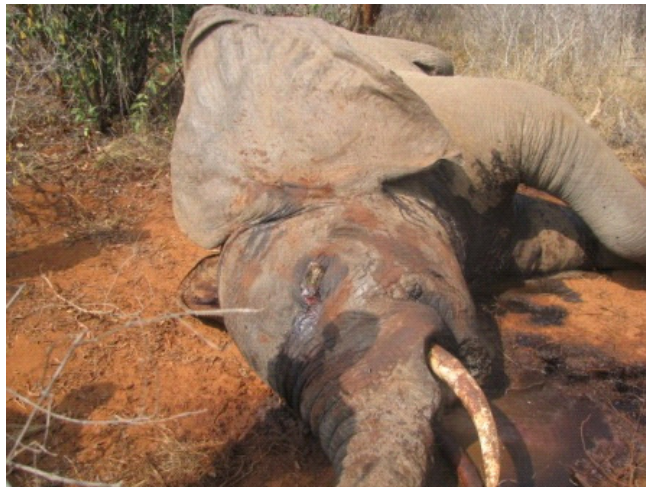
Poached elephant, killed by poison arrows