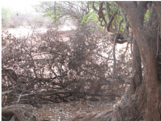
Poachers hideout near the power line