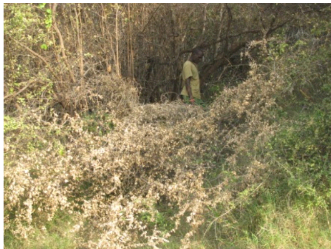
Shooting platform in the Tiva area