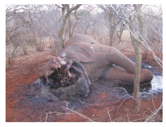
Elephant carcass with tusks missing