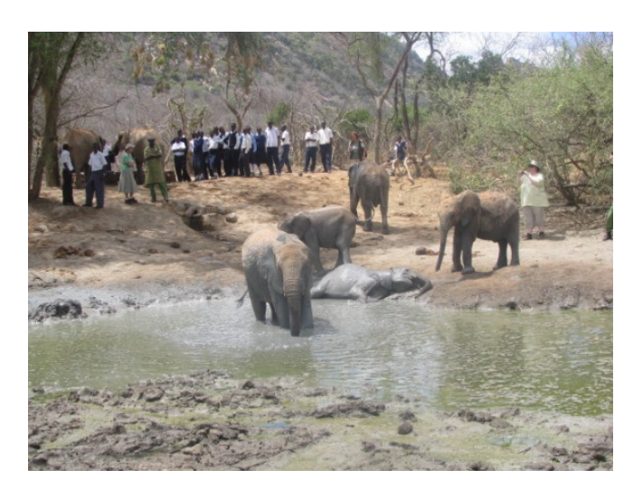
The Kasaala students learn about the elephant orphans and see them during their mudbath