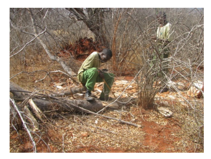
Logging at Kanziko