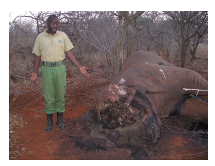
Elephant carcass found near Ithumba