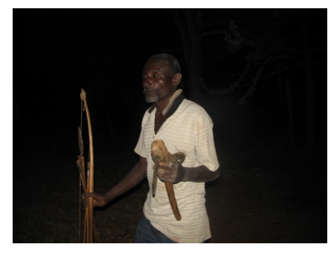
Arrested poacher in possession of poison arrows