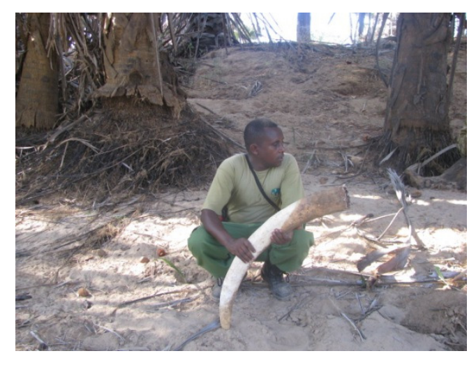
Elephant tusks recovered along the river