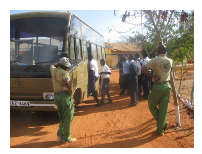
Kasaala students board the bus for their trip