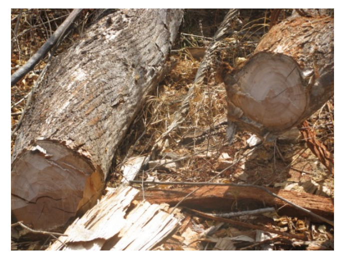
Logging at Kanziko