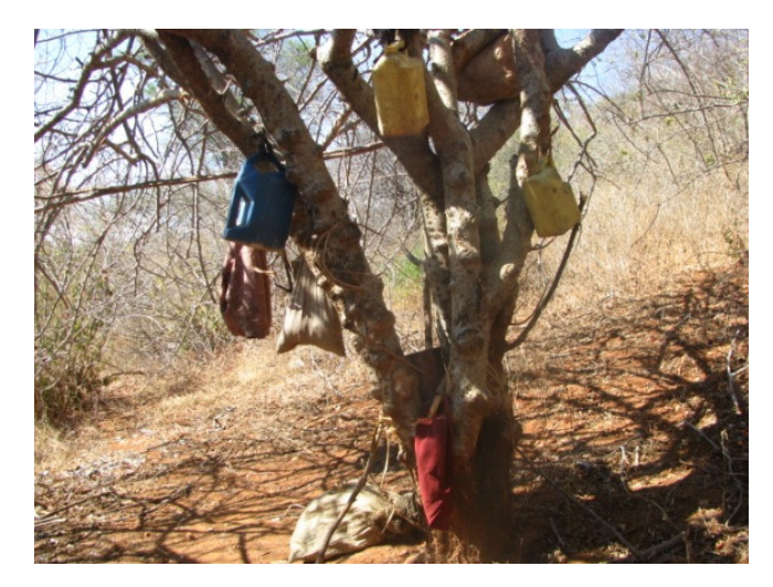
Poachers' hideout near the Tiva river