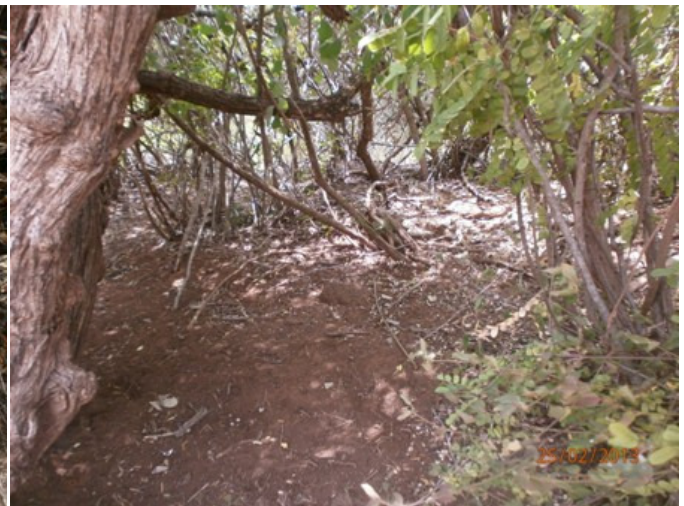
Above: Poachers' hide out around KARI area.