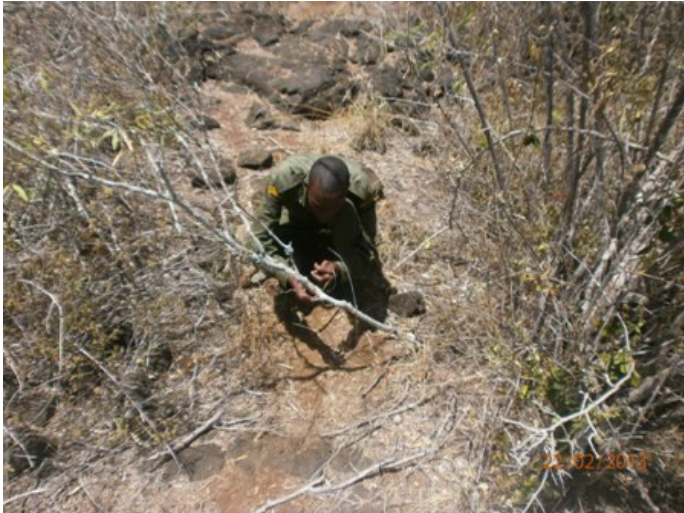
Above: Destroying a snare in Kiboko area.