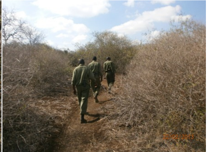
Above: Mamba team on patrol.