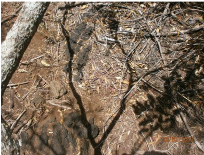
Above: A destroyed snare around Kiboko area.