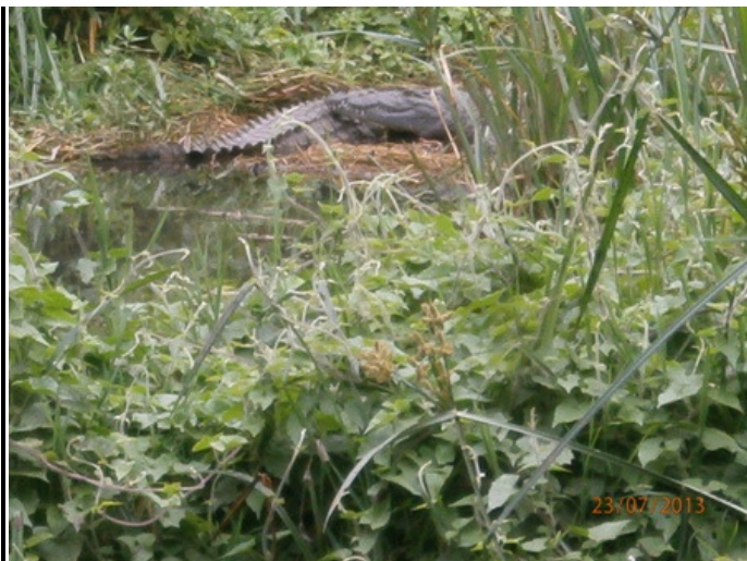
Crocodile at Umani.