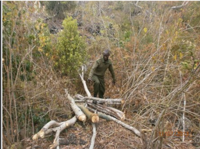
Logging sighted near the fence line.