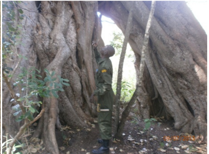
Bush breakfast site.