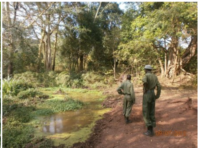
Patrol around Umani spring area.